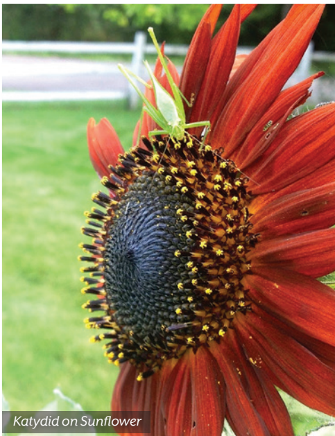
Katydid on Sunflower