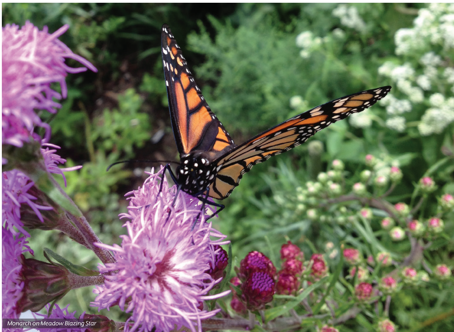
Monarch on Meadow Blazing Star