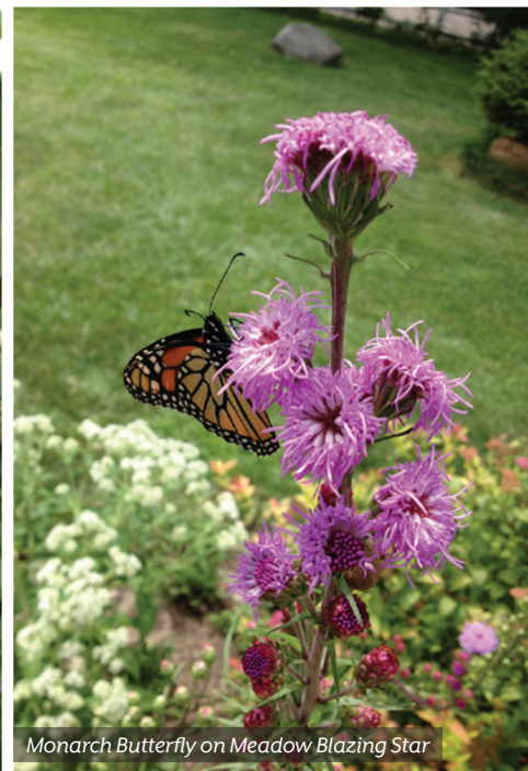
Monarch Butterfly on Meadow Blazing Star