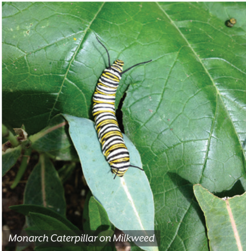
Monarch Caterpillar on Milkweed