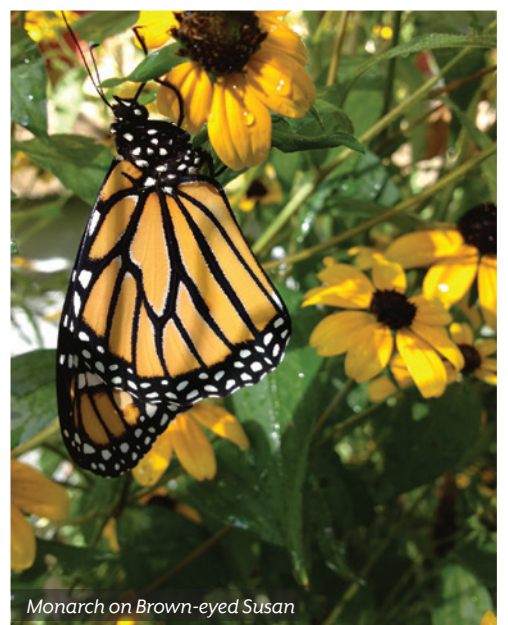
Monarch on Brown-eyed Susan