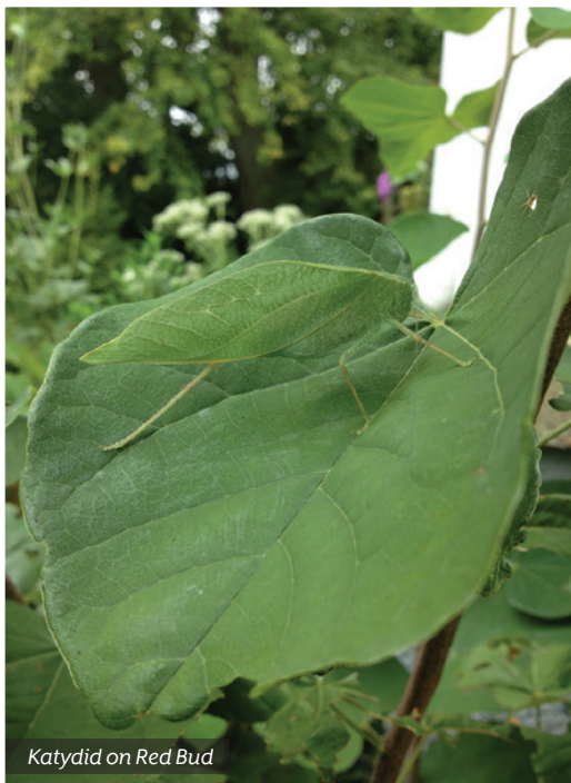
Katydid on Red Bud