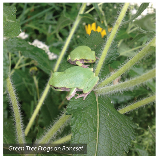
Green Tree Frogs on Boneset