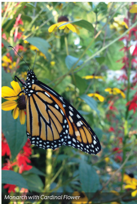
Monarch with Cardinal Flower