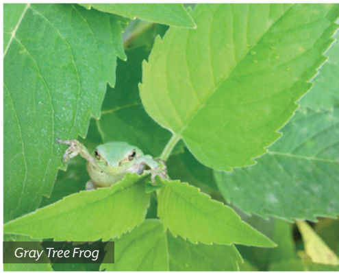
Gray Tree Frog