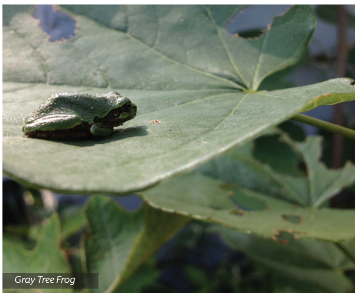
Gray Tree Frog