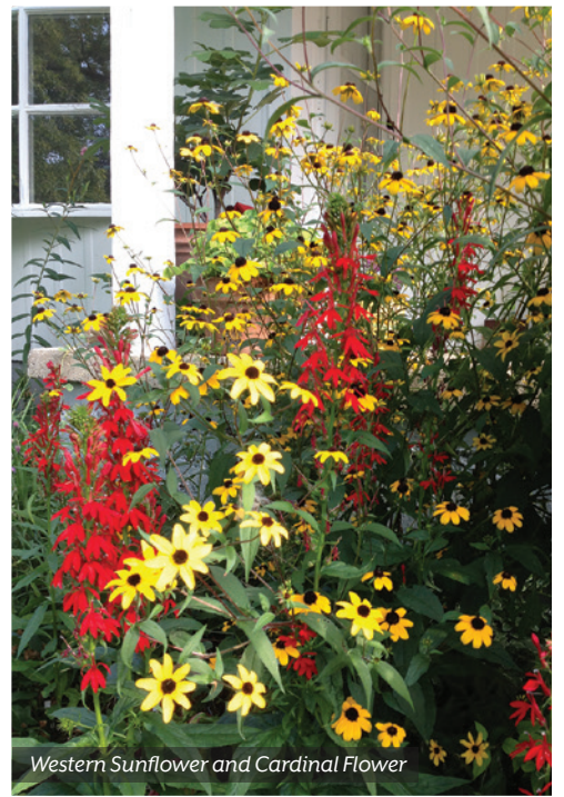
Western Sunflower and Cardinal Flower