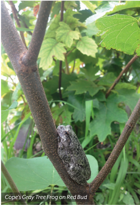
Cope's Gray Tree Frog on Red Bud