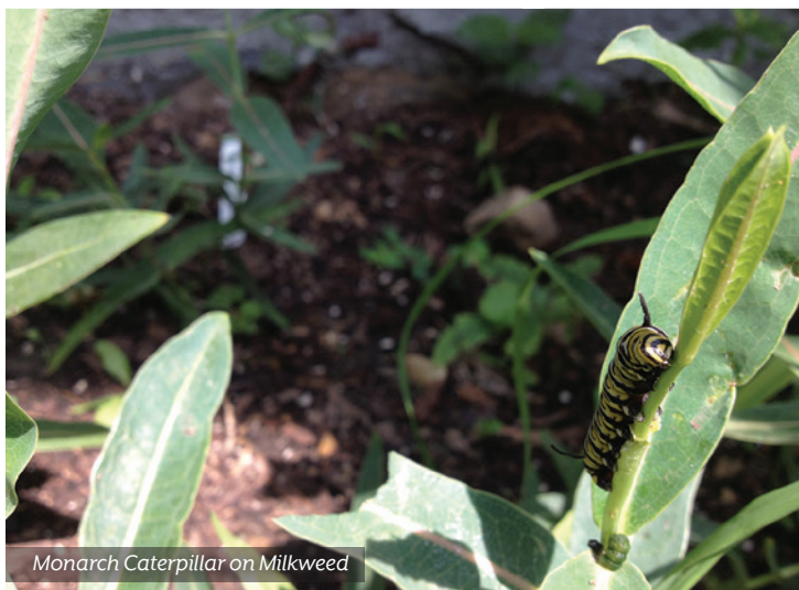
Monarch Caterpillar on Milkweed