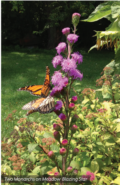
Two Monarchs on Meadow Blazing Star