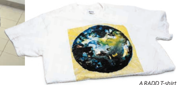
A RADD T-shirt