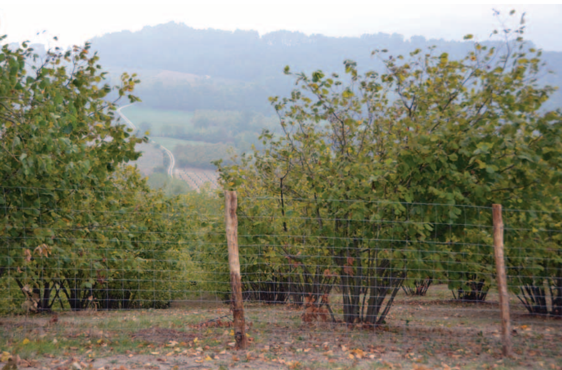
The hazelnut trees at Cascina Langa. The property's name is translated as "farmhouse of the Langhe", the wine-growing region of Piedmont, Italy.