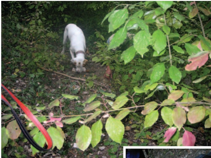
A dog locates truffles in the ground. Inset: A white truffle (below) and black truffle are found.