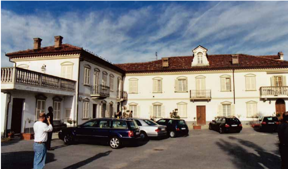
The Poderi Aldo Conterno estate is located in the Piemonte region of the district of Langhe. The winery, located in Monforte d'Alba, chiefly produces Barolo wines.

Another great memory involved a wine press many centuries old. I remarked to Aldo that it must have taken a true craftsman to carve the auger (screw). He agreed, but reckoned that it probably took considerably more skill to carve the female part of the press - touché. Also of interest was the wine bottle collection, including the world's largest known bottle (with a mind-boggling volume).