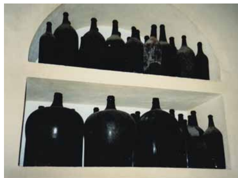
Antique wine bottles are displayed at Poderi Aldo Conterno.