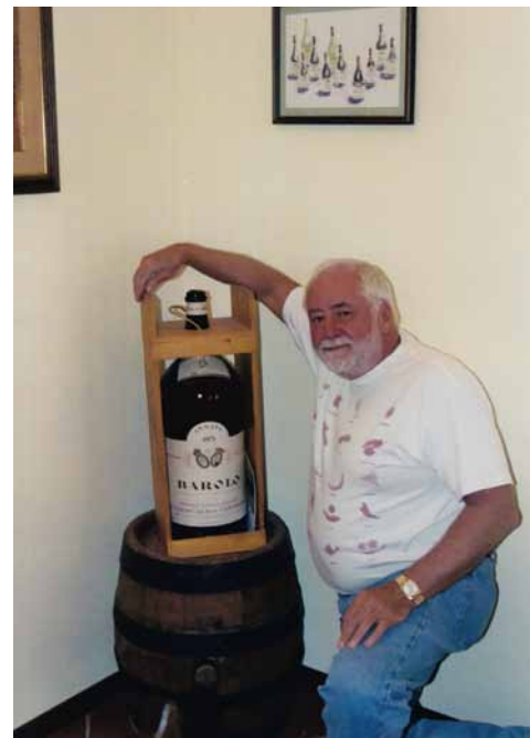
A keepsake bottle of Barolo from 1971.