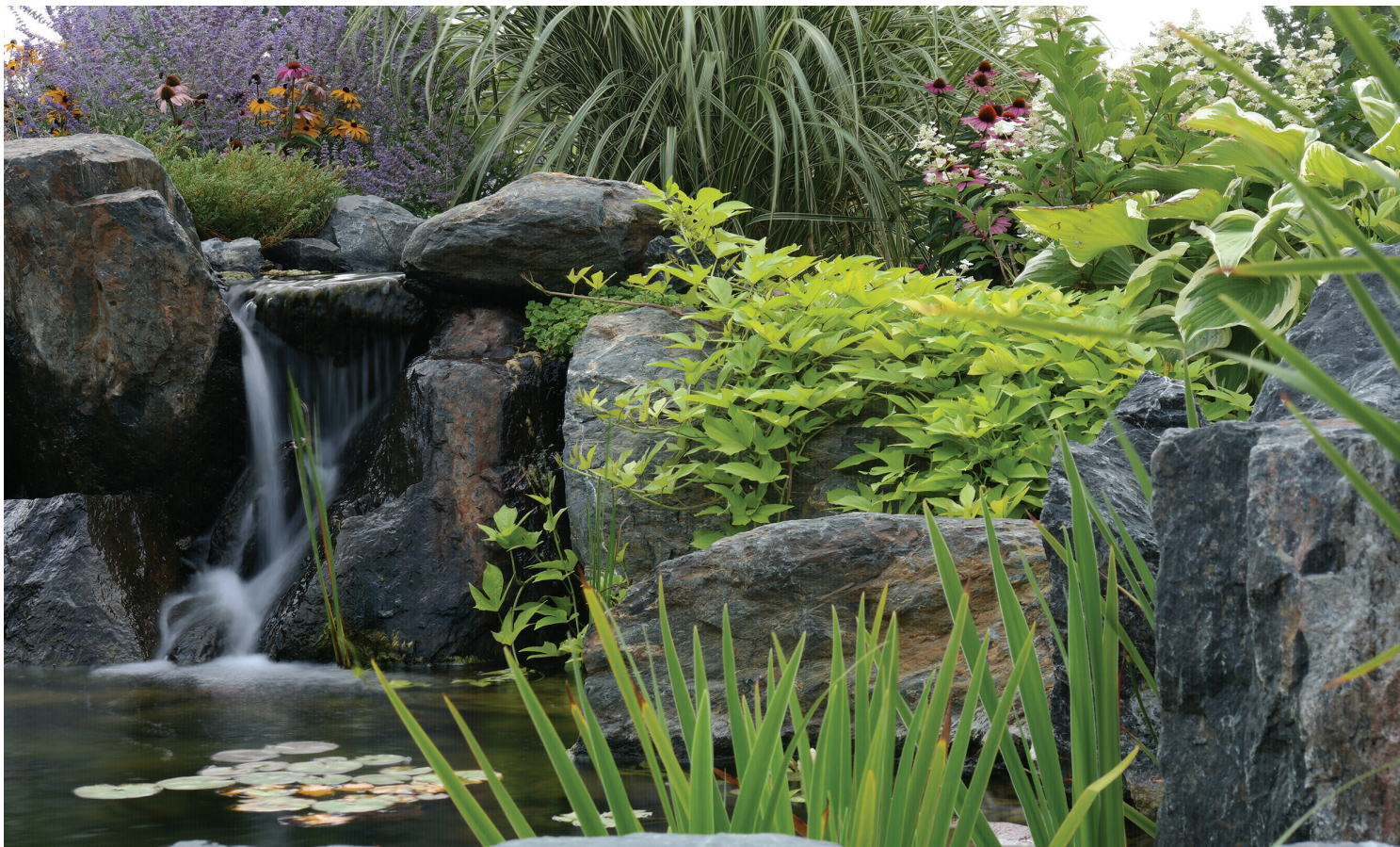
Debby and Mike Piraino's new water garden is a beautiful and safe focal point around which they and their children and grandchildren gather to relax.