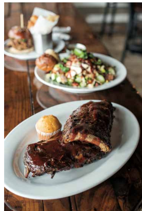
A signature item at Big Iron Horse is the baby back ribs served with a sweet cornbread muffin.