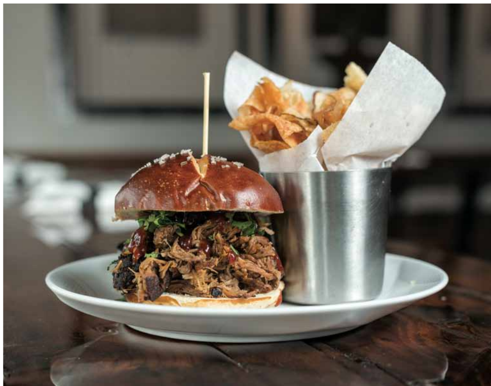
One of Big Iron Horse's signature sandwiches is the 12-hour smoked and hand-pulled pork on a soft pretzel bread bun served with homemade potato chips. Chipotle Maple barbecue sauce is one of the custom-blended barbecue sauces available.