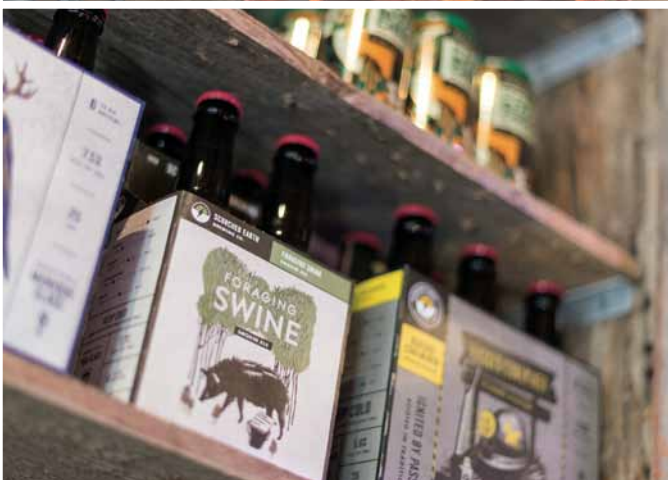
This mellow, malty sweet and smoky ale sold at Big Iron Horse is a craft beer brewed by Scorched Earth Brewing Company, in Algonquin.