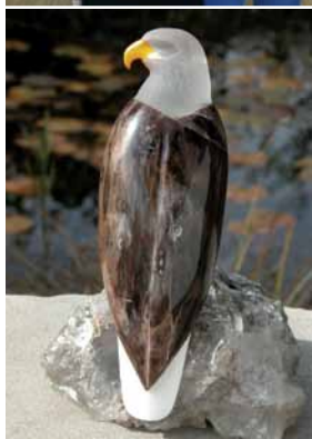
The American Eagle is an example of the architectural art created by

second-generation Austrian artist Florian Schluifer. His sculptures are handmade, seamless fusions of light-penetrating colored crystal with rare natural materials, such as petrified swamp or other natural materials. www.schluifer.com