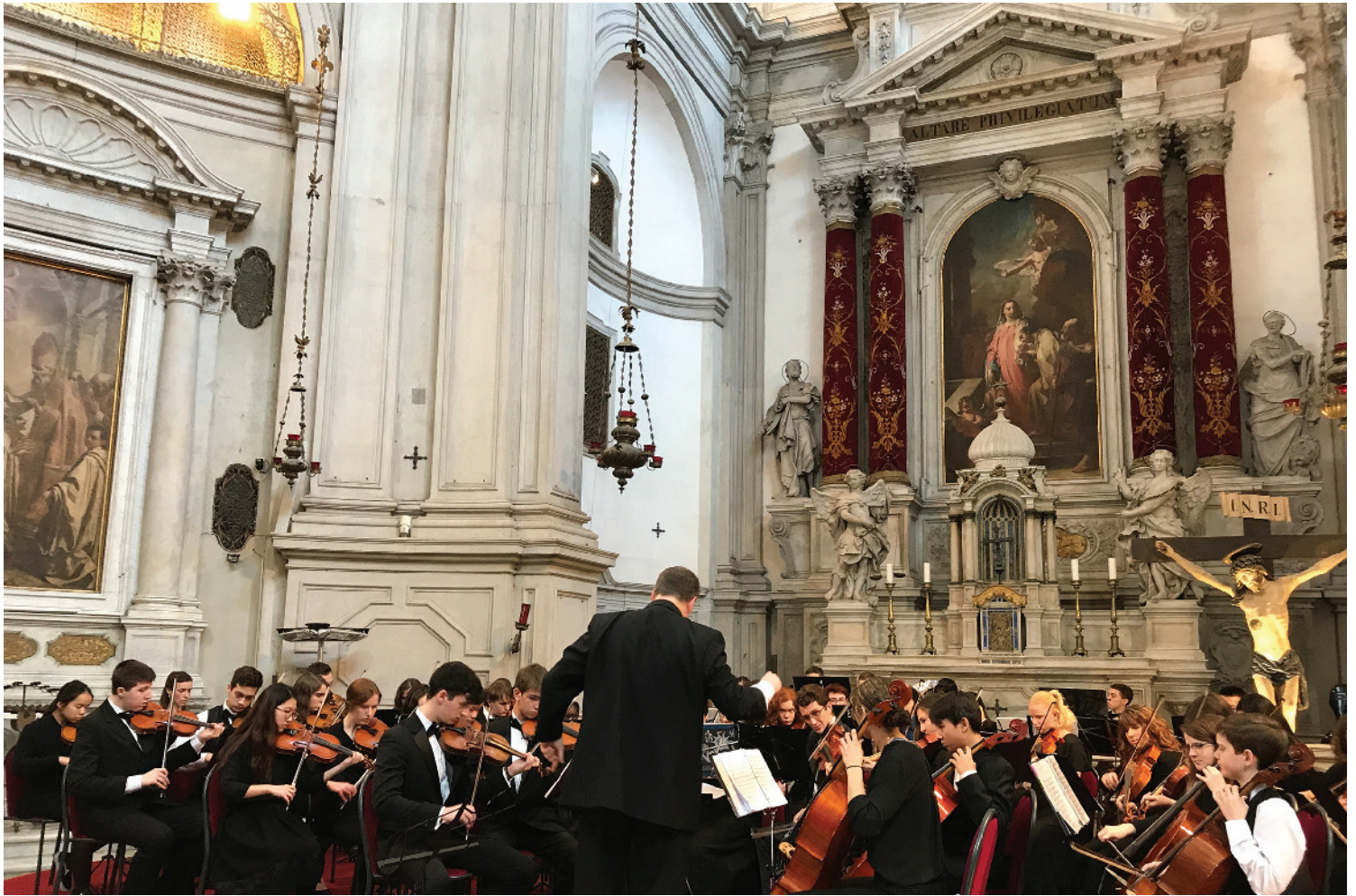
Students perform a concert at the Vivaldi Church in Venice.