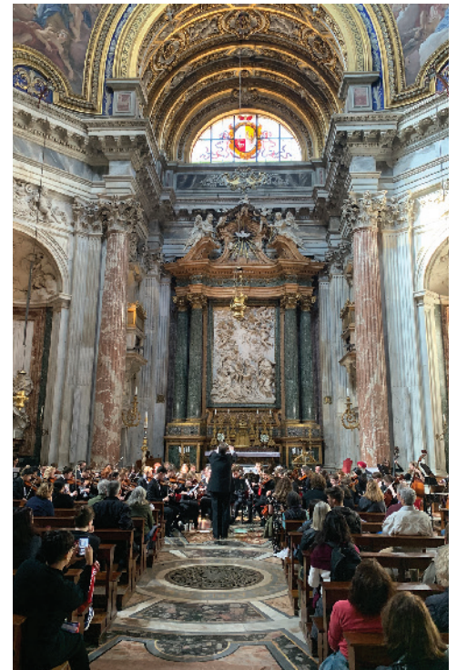
The Barrington and Deerfield orchestra members perform at Saint Agnes Church in Rome.

Shortly after arriving in Milan on the first day of their "2019 Musical Tour of Italy," the orchestra headed to Cremona to visit the Stradivarius Museum for a lesson in the artistry of violin making, a peak at dramatically lit displays of $12 million violins crafted centuries ago by local families, and a look inside the museum's auditorium, acoustically designed for recitals.