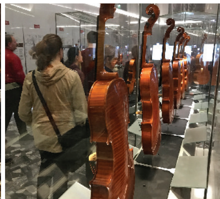
Priceless violins were seen at the Stradivarius Museum.