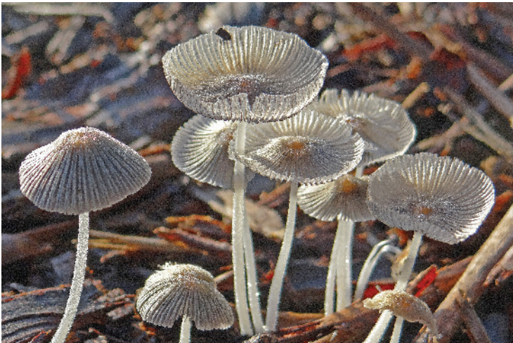
These lovely mushrooms showed up one day after workers cut down a tree and were completely gone the next day.