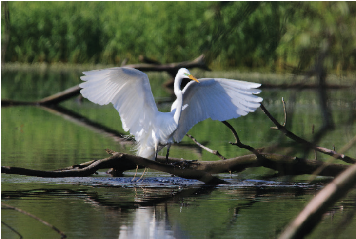
An egret wakes me up after I fell asleep in my blind. I was waiting for wood ducks.