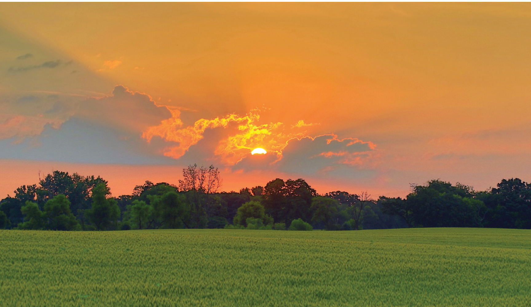
A sunrise over Barrington Hills Farm.