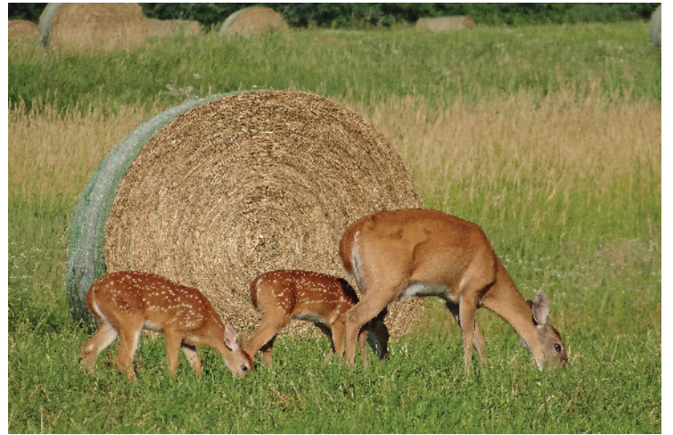
Doe and her two fawns oblivious to an 1,100 lb. bale. The farm's hayfield produced hundreds of the bales during the 2018 season.