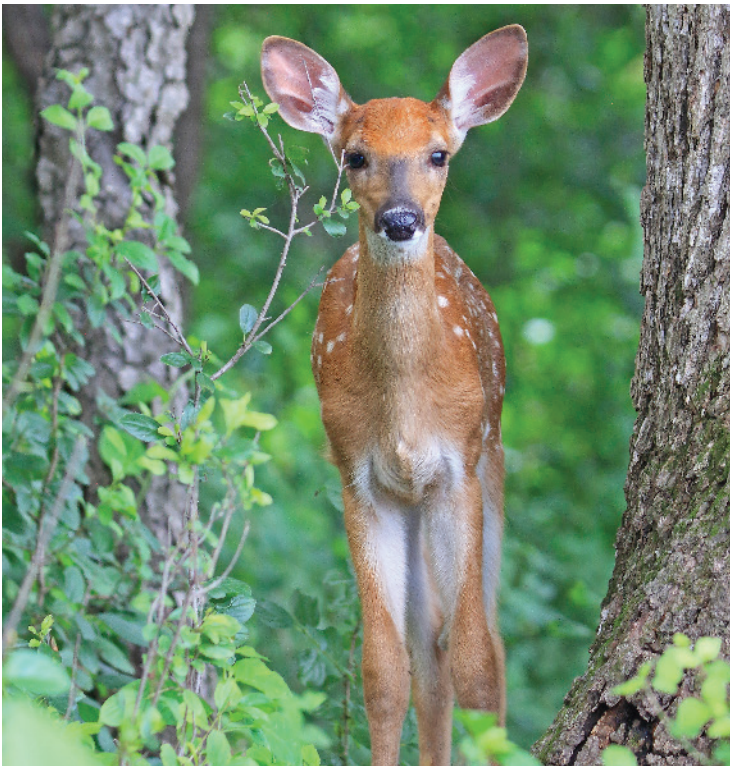
A fawn stops to pose for my camera.