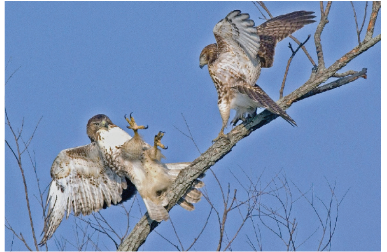
Two young Coopers Hawks engage in a treetop sparring match.