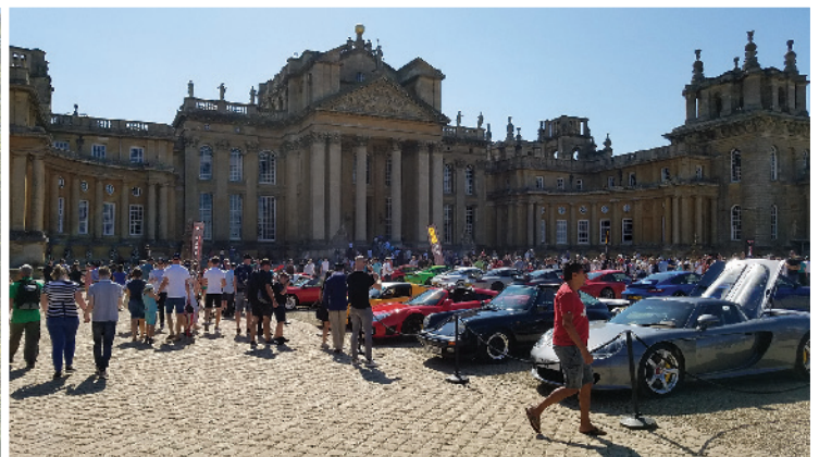
A car show at Blenheim Palace.