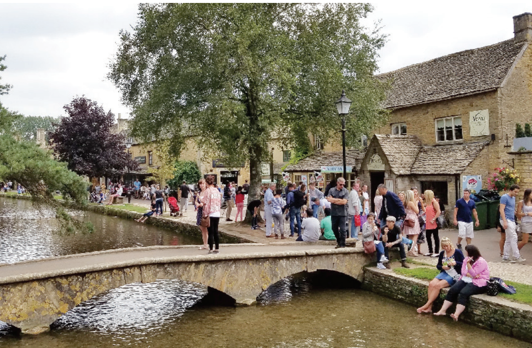
Bourton-on-the-Water is also known as the Venice of the Cotswolds.

and galleries, and is the starting point for popular “Walking the Cotswolds” tours.