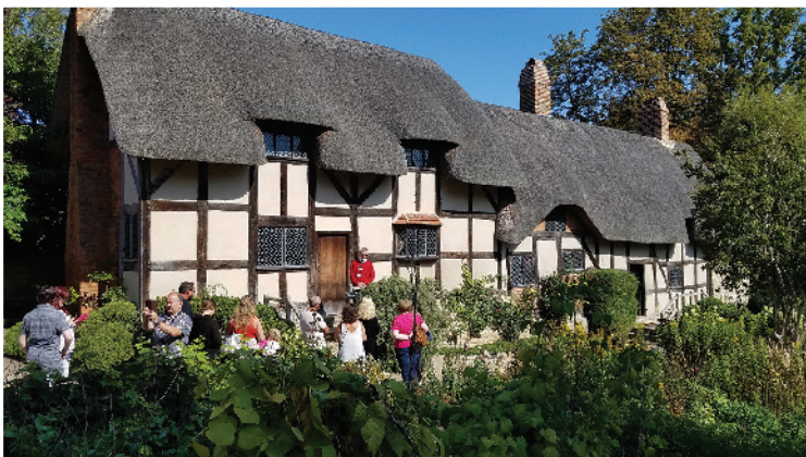
Anne Hathaway’s childhood home in Stratford-upon-Avon.