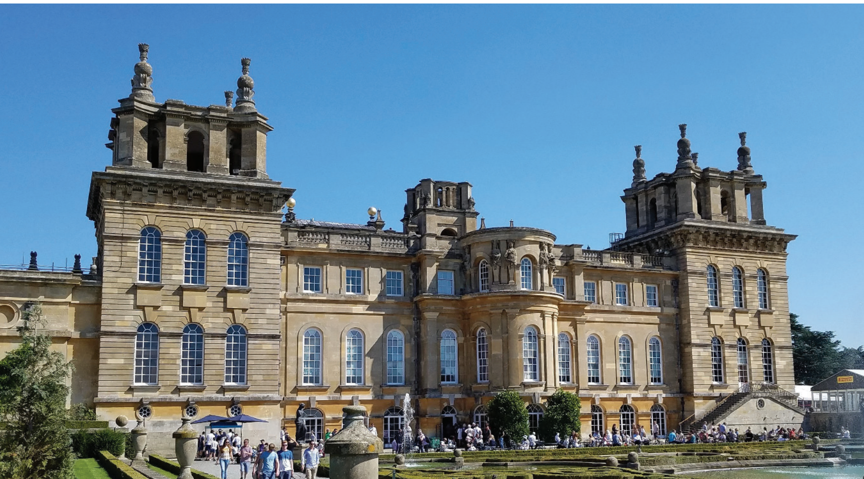
Blenheim Palace is home to the 12th Duke of Marlborough.