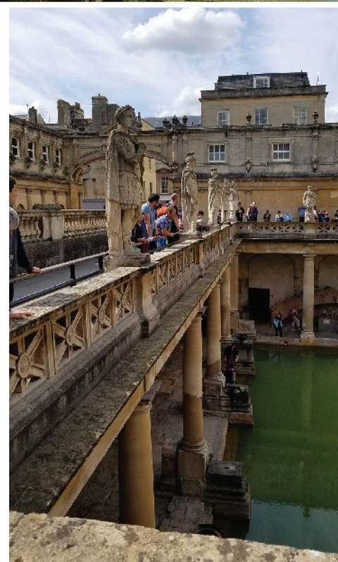
The Roman Baths from 65 A.D.

One of the more popular villages is Stow-on-the-Wold. Built at the highest point of the Cotswolds (800 feet), "Stow" is at the junction of seven major roads, providing a good hub from which to explore the region. This famous market town was once the center of wool trade, selling up to 20,000 sheep per day. Stow has many taverns, boutiques,