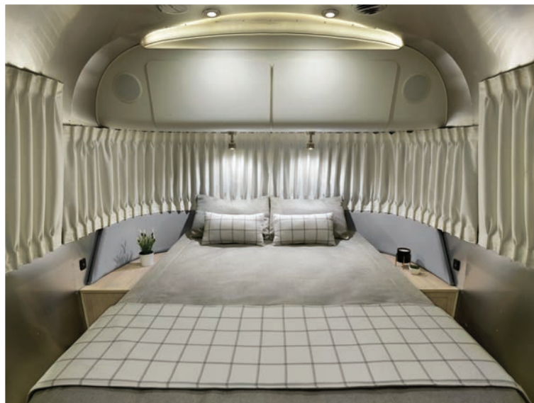
Both bedroom floorplans come standard with blackout curtains, under bed storage, and a Samsung LED TV.