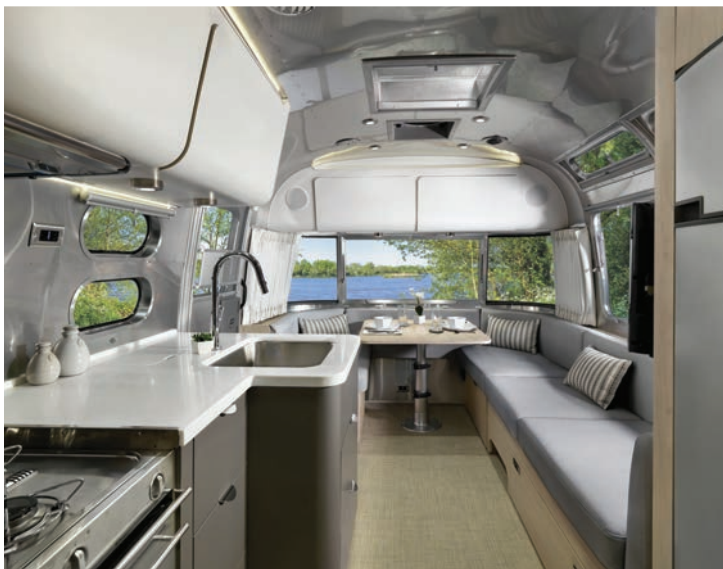
With clean, sleek lines, the Globetrotter offers an air of sophistication in a timeless design.