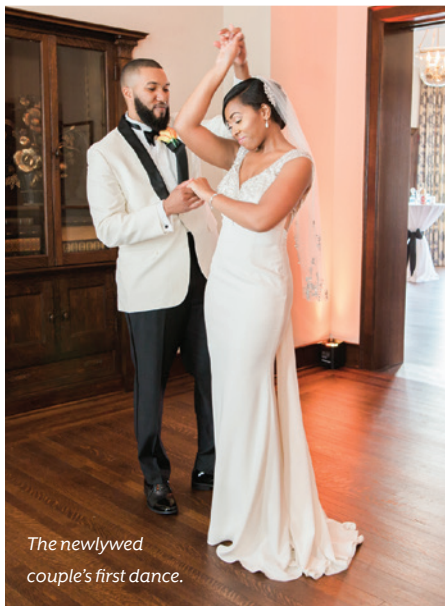
The newlywed couple's first dance.