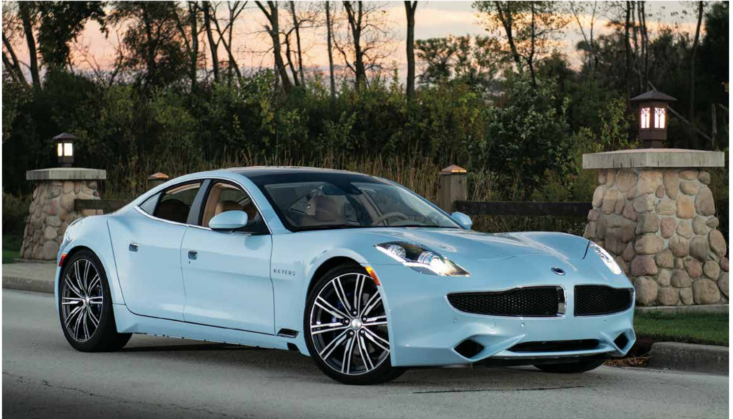
Revero is a combination of two Latin words— Re and Vero , meaning continuous improvement and truth. The Balboa Blue paint and optional 22-inch wheels made a striking combo on my test vehicle.