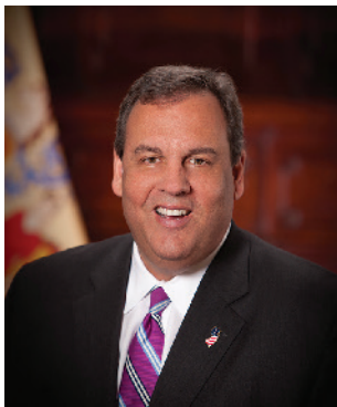
New Jersey Governor Chris Christie