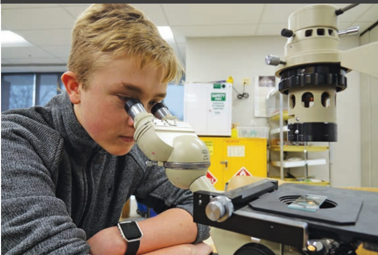
The curriculum at Quest Academy is aligned with state and national standards without the constriction of grade-level restraints.