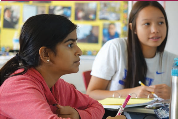
Students at Quest Academy develop into thoughtful individuals who ask more complex questions, channeling their inner curiosity.