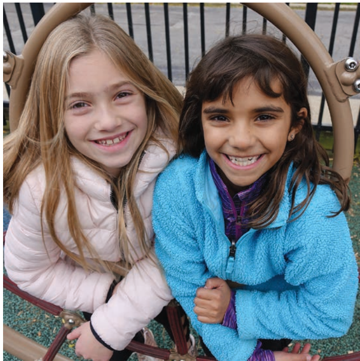
Quest Academy is a private school serving gifted children from preschool through eighth grade.

offered, children may still become disinterested and frustrated with the classroom experience, both in content and process. Children who find themselves in an environment that is not designed for their learning needs may exhibit behaviors that are tangential to the actual learning, including acting out in class or expressing social emotional concerns that may result in anxiety, depression, or low self-confidence. As a result, parents may find themselves struggling to discover the best course of action for their young children to ensure emotional well-being and foster a love for learning.