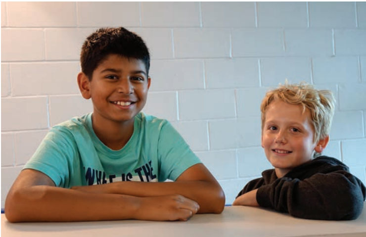
Quest Academy keeps classroom sizes to no more than 17 students.