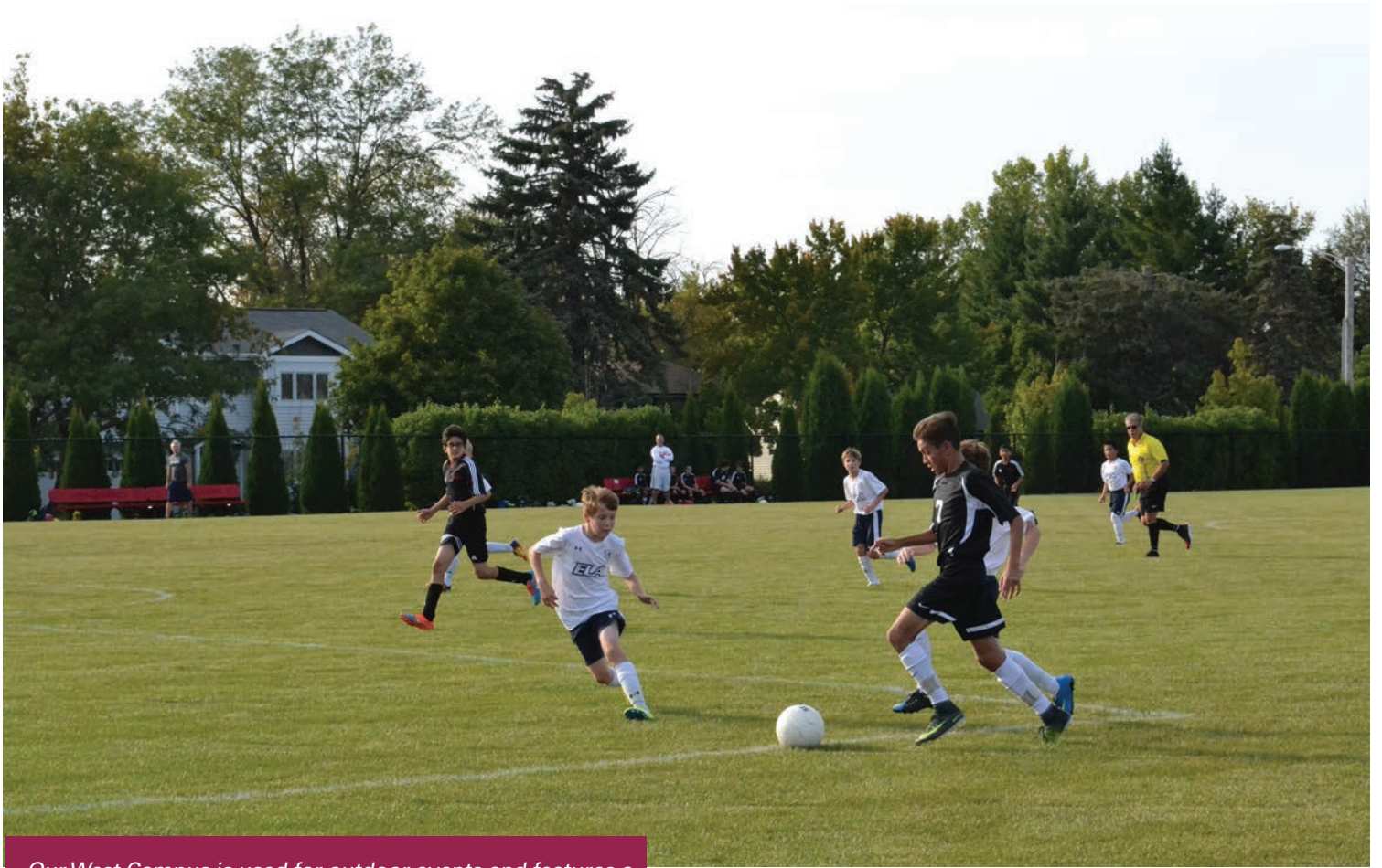
Our West Campus is used for outdoor events and features a nature walking path, outdoor amphitheater, basketball court, raised gardens, soccer field, and science exploration area.