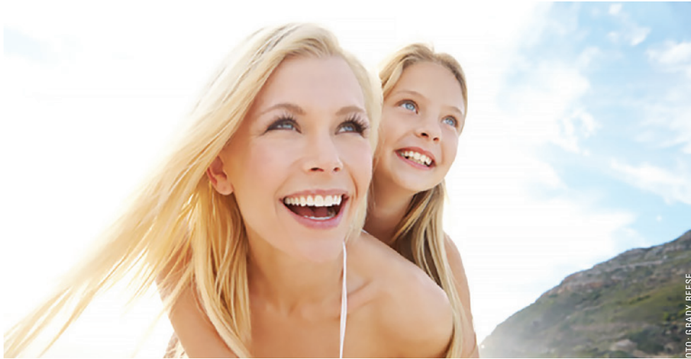
Splash in the water to your heart's content just 24 hours after a lash extension application.