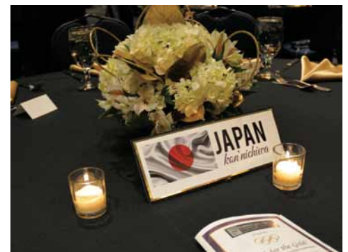
Olympic-themed decor by Christina Currie Events.