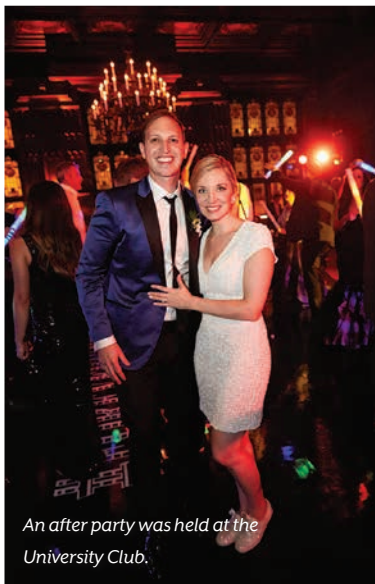
An after party was held at the University Club.