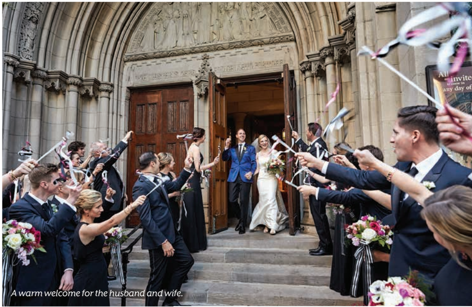
A warm welcome for the husband and wife.