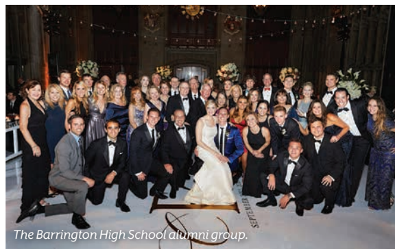
The Barrington High School alumni group.