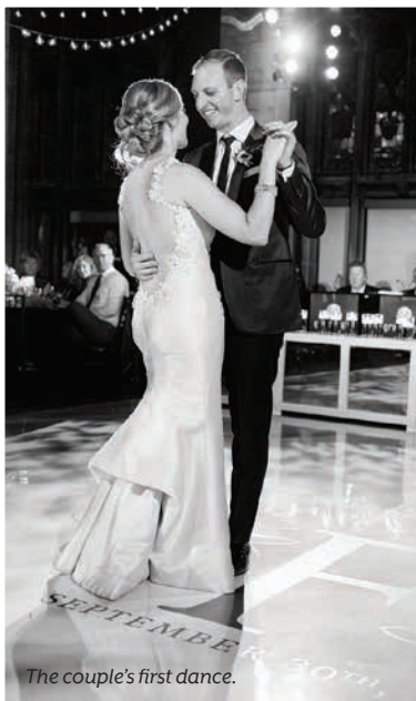
The couple's first dance.