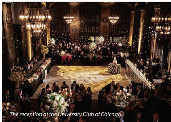
The reception at the University Club of Chicago.