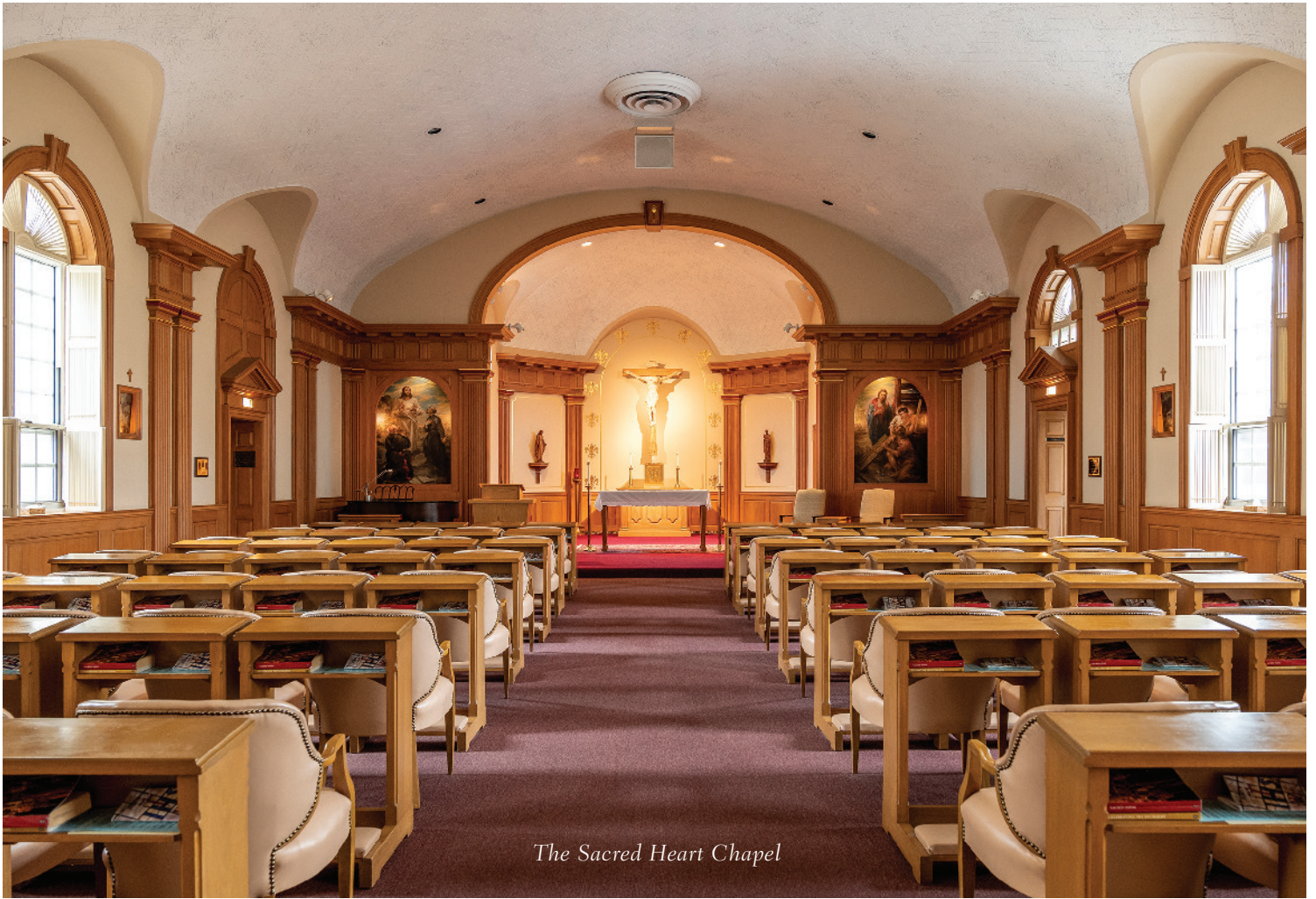
The Sacred Heart Chapel