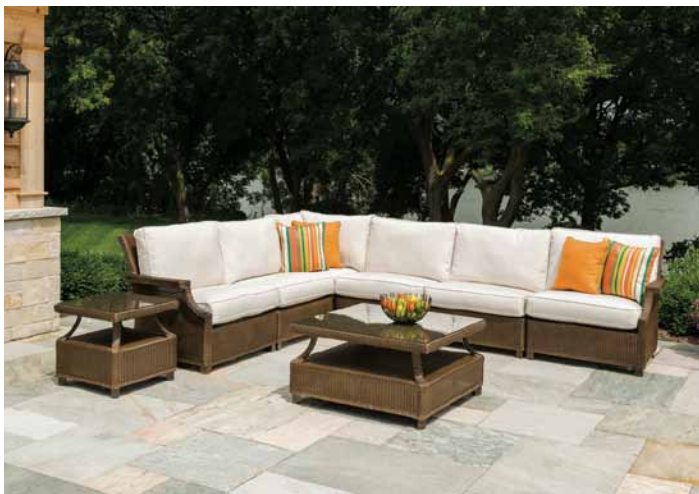
Lloyd Flanders Hamptons collection uses a woven a process by which cellulose strands are woven into a wicker fabric for durability and ease of care.

trends: Berlin Gardens, Lloyd Flanders, Homecrest, and OW Lee. For buyers who need help with outdoor furniture, Viking Ski & Patio will design the space, deliver the furniture, and assemble it completely. All of the furniture mentioned here is made in the U.S.A.