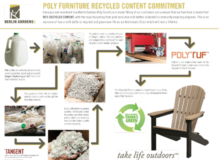
The lifecycle of Berlin Gardens' poly product, from recycled milk jugs to near indestructible, long-lasting outdoor furniture.