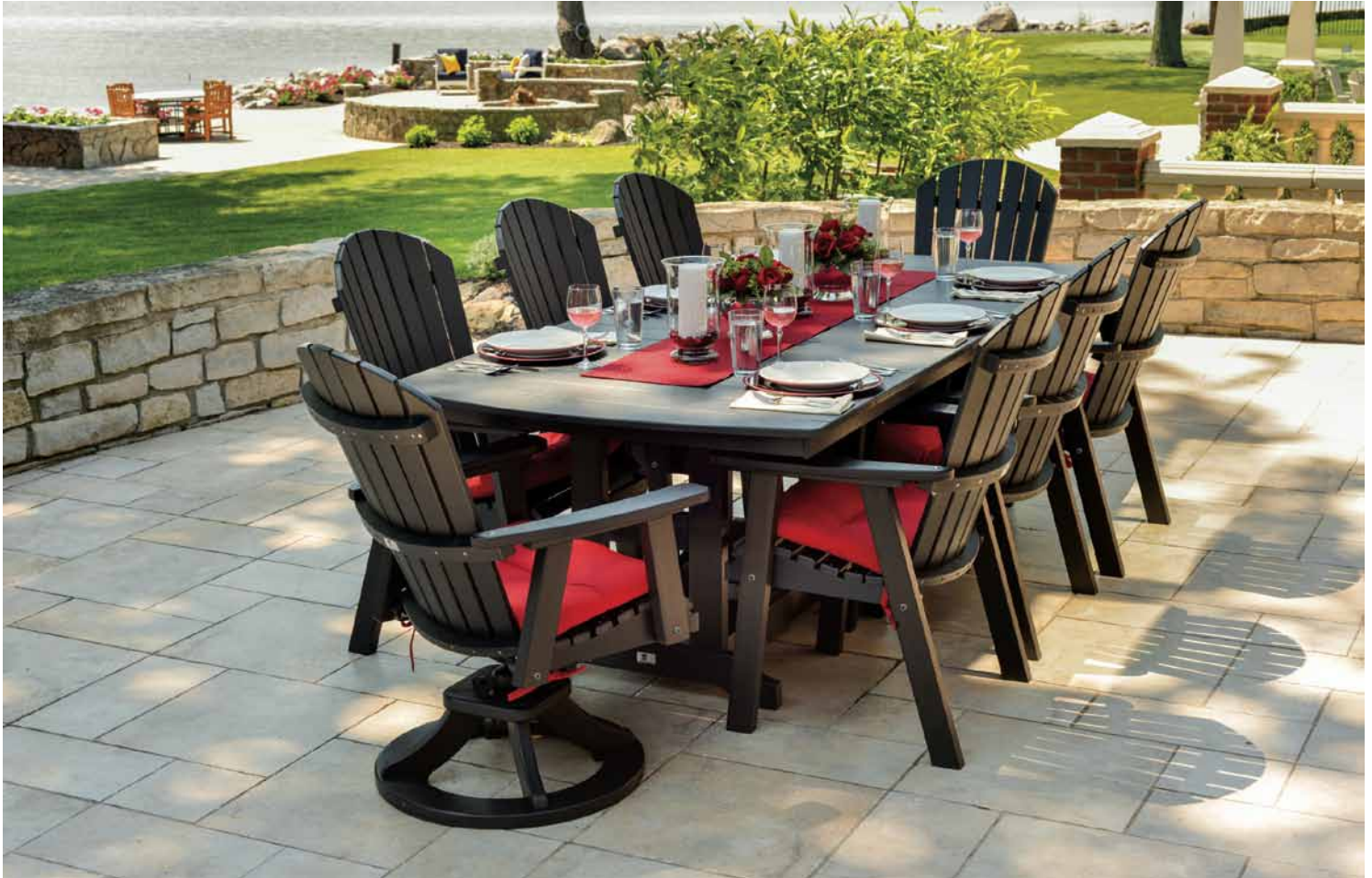
Berlin Gardens' Comfo-Back dining chairs and swivel rockers with a 44"x 96" table.