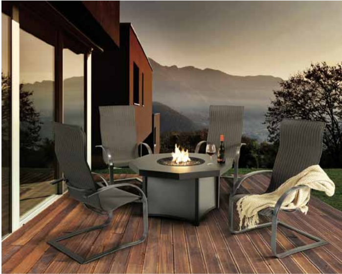
The Homecrest Lana uses a sling aluminum spring base dining chair and a Lunar aluminum octagon fire pit table with leather embossed aluminum top.