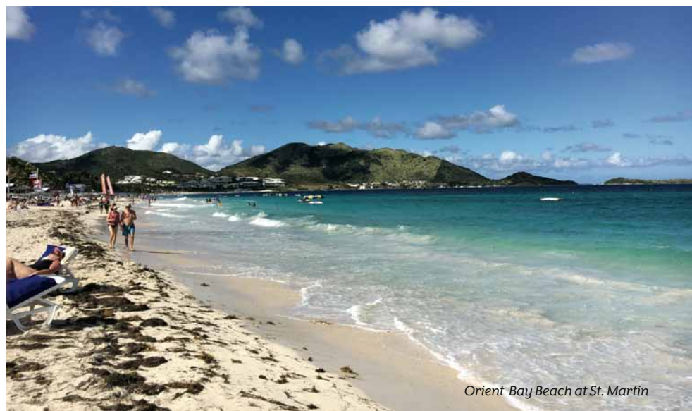
Orient Bay Beach at St. Martin

If you want a sense of what’s new and exciting in the Caribbean, Turks and Caicos is my strongest recommendation! There is so much going on