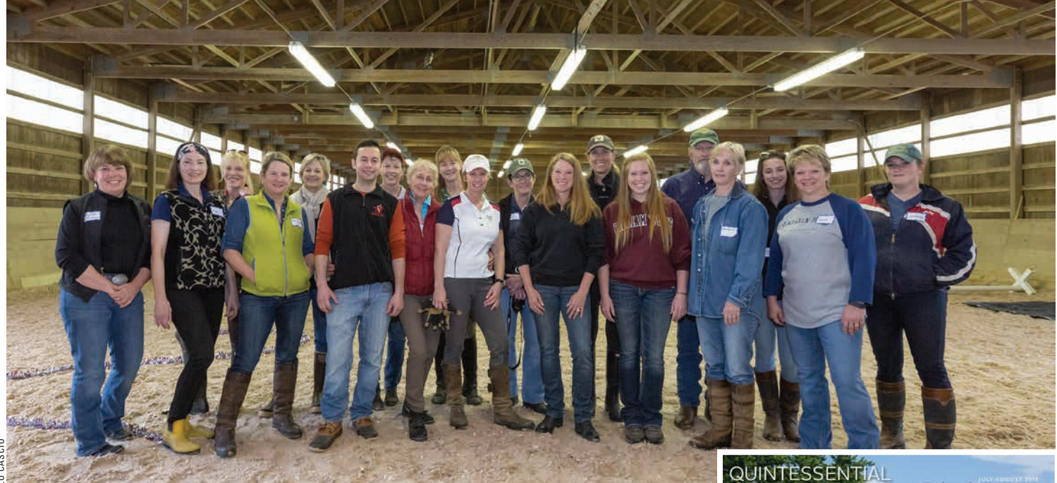
HARPS staff and community volunteers educate local law enforcement and emergency responders on how to work with horses in emergency situations.