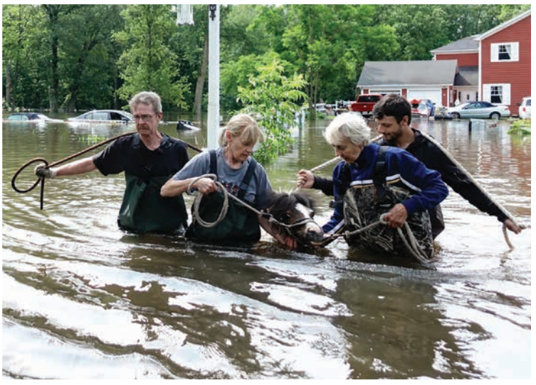
HARPS helps rescue animals at a farm hit by the Des Plaines River flood in July 2017.