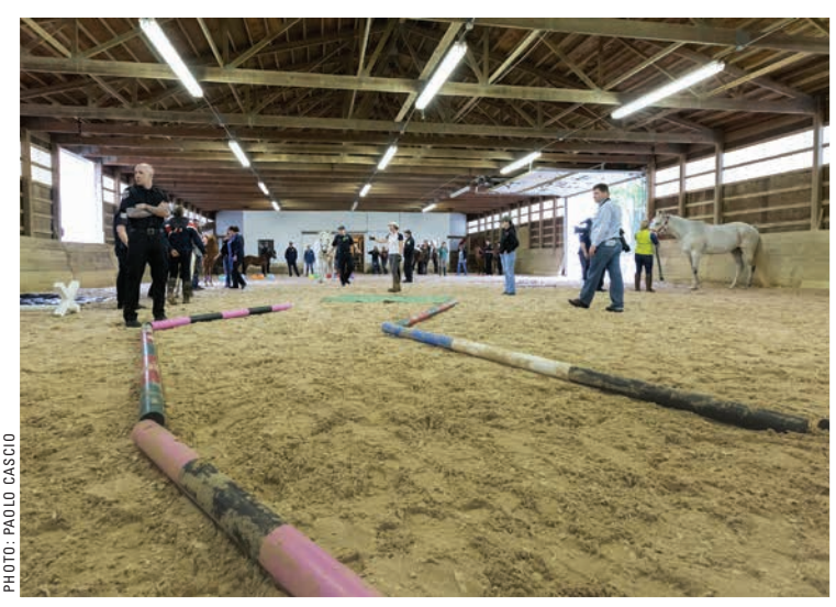
To help with leading horses in difficult situations, an obstacle training course was created using ground poles.