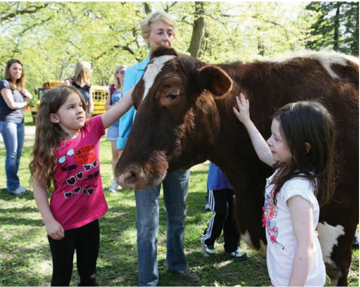
HARPS' rescued animals are available for children's education.