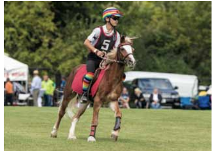
A member of The Fox River Valley Pony Club.