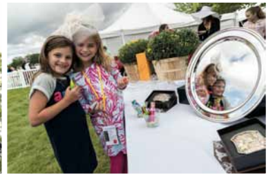
A visit to the awards table.