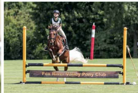
A member of The Fox River Valley Pony Club.