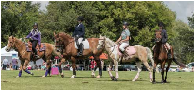
A quadrille performed by The Fox River Valley Pony Club.