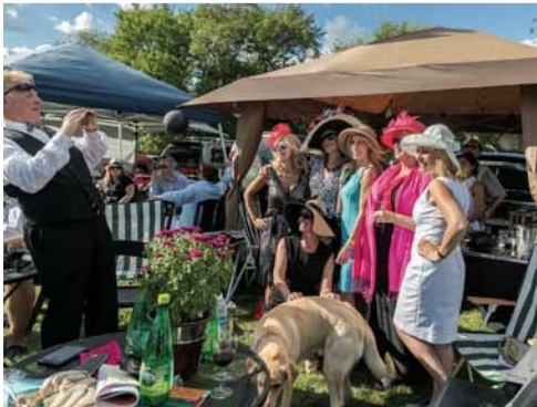
Guests enjoy a day at polo.