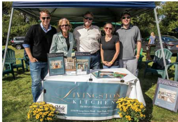
Livingston Kitchens supports polo.