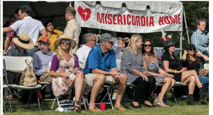
Polo Charity Partner Misericordia benefited from the event.