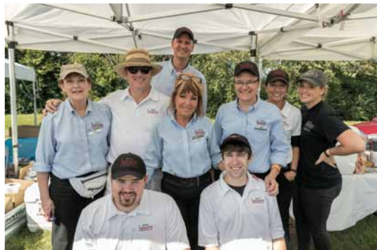
The crew from Heinen's Fine Foods.