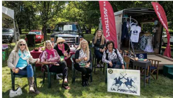
Barrington Saddlery featuring La Martina is the Barrington Hills Polo Club's official outfitter and a sponsor.