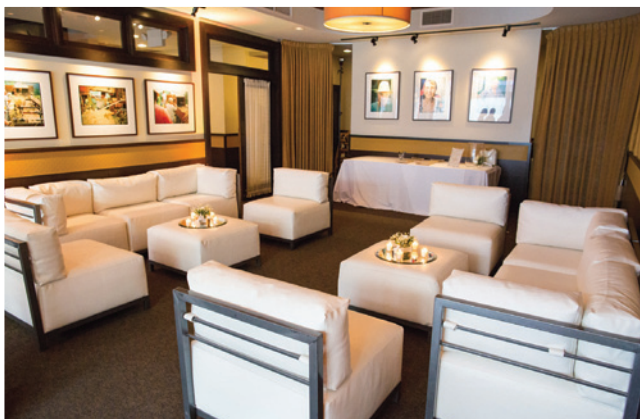
A space adjacent to the banquet room at Francesca's Famiglia restaurant in Barrington was converted into a guest lounge.