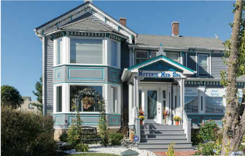
Motykie Med Spa is located at 320 E. Main Street in Barrington.