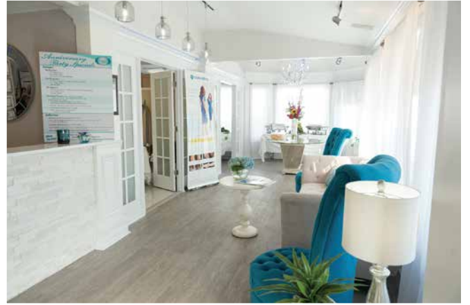
Motykie Med Spa clients are greeted at the front reception area.