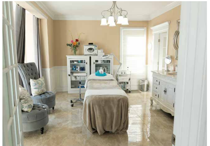
The Motykie Med Spa aesthetics treatment rooms are modern and beautiful.