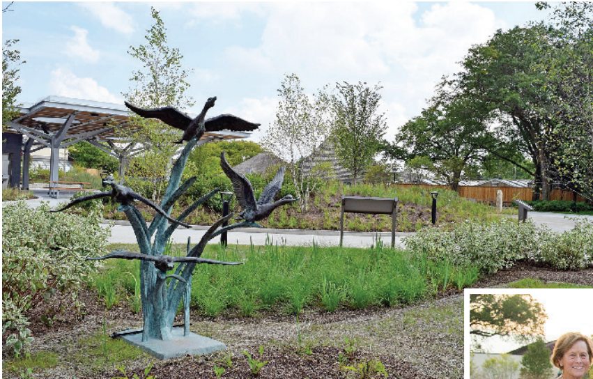
Hamill Family Nature Plaza's landscape features more than 10,000 perennial plants and 8,200 Square feet of perennial seeds. Additionally, more than 650 deciduous, evergreen, and flowering trees and shrubs were planted throughout the 1.5-acre space.

MORE THAN 85 PERCENT OF AMERICANS live in an urbanized area, many without easy access to green spaces and exploring the outdoors. The Chicago Zoological Society, which is committed to providing nature-related and animal experiences in a welcoming environment, announced on September 20, 2019, a new learning, fun, and exploration space at Brookfield Zoo. Located at the south end of the park, the Hamill Family Nature Plaza sits on the site of the former Baboon Island. Additionally, the restaurant previously known as Scoops has been renovated and reopened as Peacock Café and Grill. The nature plaza was made possible through a generous donation from the Hamill Family Foundation.