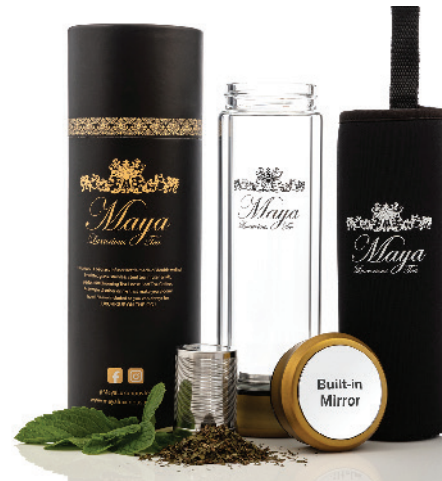
Tea Infuser Bottle by Maya Luxurious Tea, Leak-proof Double Wall Glass Travel Tea Mug with Stainless Steel Filter, BPA Free Tea Tumbler + Strainer for Loose Leaf Tea, Coffee Thermos, Fruit Water 14oz

Why Be Plain When You Can Bloom into Luxurious?