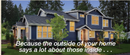
Because the outside of your home says a lot about those inside . . .

THE VERY BEST INSTALLATION OF QUALITY WINDOWS, DOORS, ROOFING, AND SIDING AT A FAIR, COMPETITIVE PRICE WITH FIVE-STAR SERVICE