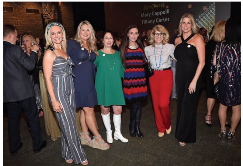
On Sept. 21, 2019 at The Discovery Center at Brookfield Zoo, Wines in the Wild was hosted by the Women's Board of Brookfield Zoo to benefit the outreach projects of the Women's Board. This year the theme was "the '70s" and was a fun and well-attended event.