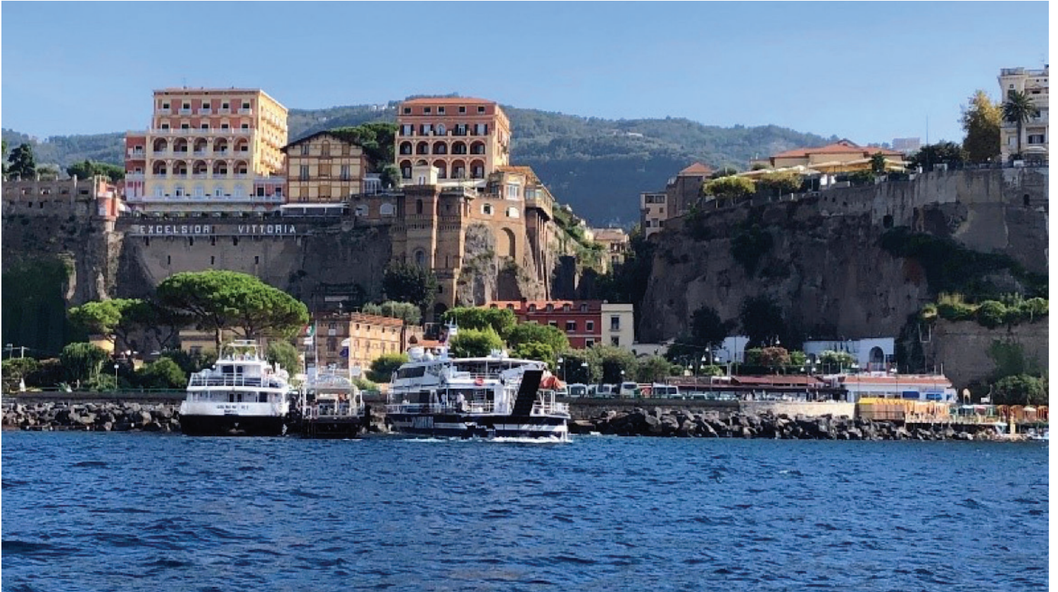
The Grand Hotel Excelsior Vittoria in Sorrento boasts a private elevator, allowing guests easy access to the resort's private beach club and the Port of Sorrento.