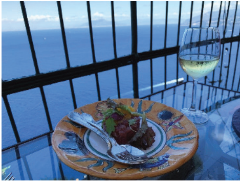
Tasting with a view at Restaurant La Terrazza di Lucullo at Hotel Caesar Augustus.