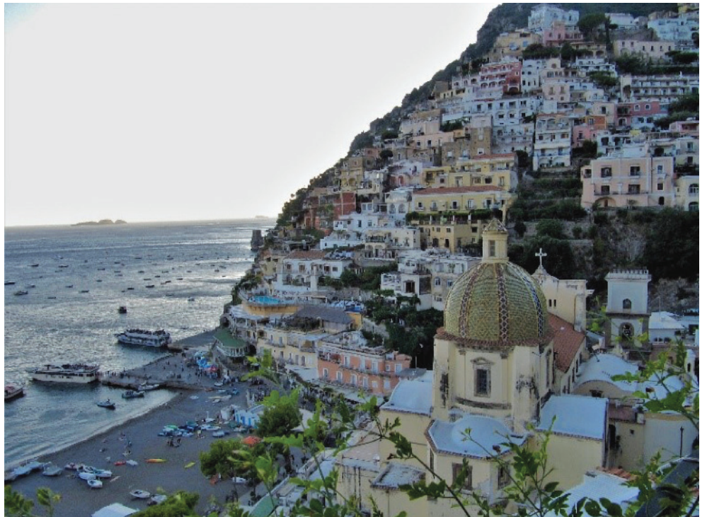
The patio at Michelin-starred La Sponda at Le Sirenuse Hotel in Positano.