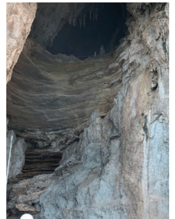
Can you spot the natural rock formation of the Virgin Mary at the top of the White Grotto?