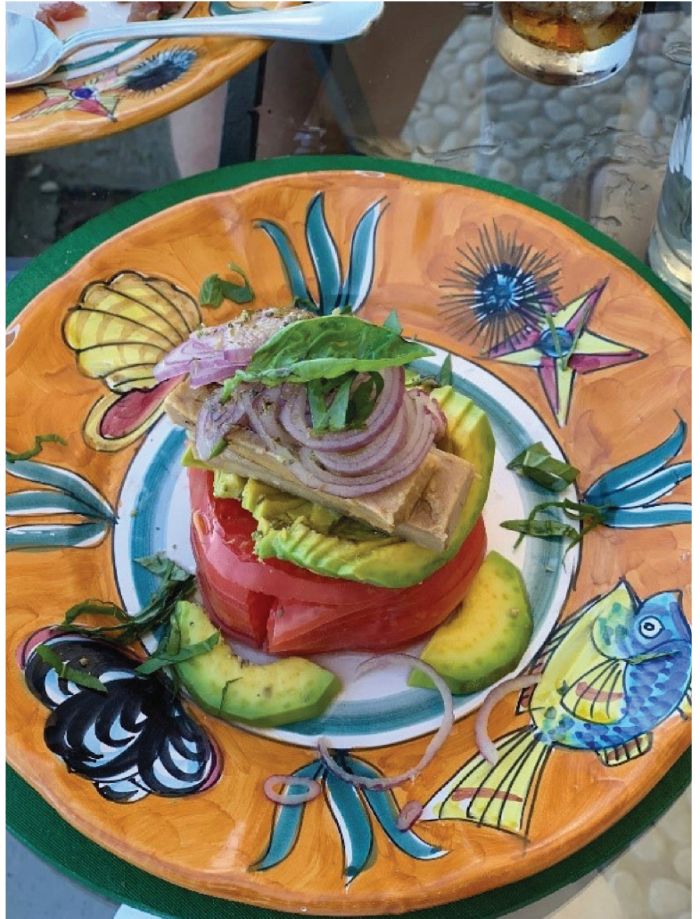
A Mediterranean Masterpiece at Restaurant La Terrazza di Lucullo.