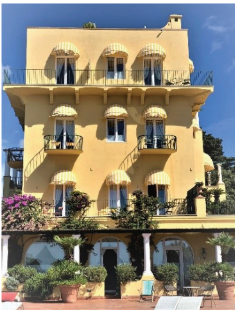
The Relais & Châteaux Hotel Caesar Augustus, the most panoramic five-star hotel on Capri.