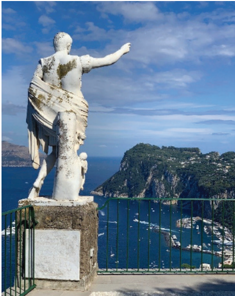
Mighty Caesar Augustus, the great-nephew of Julius Caesar, overlooking the Bay of Capri.