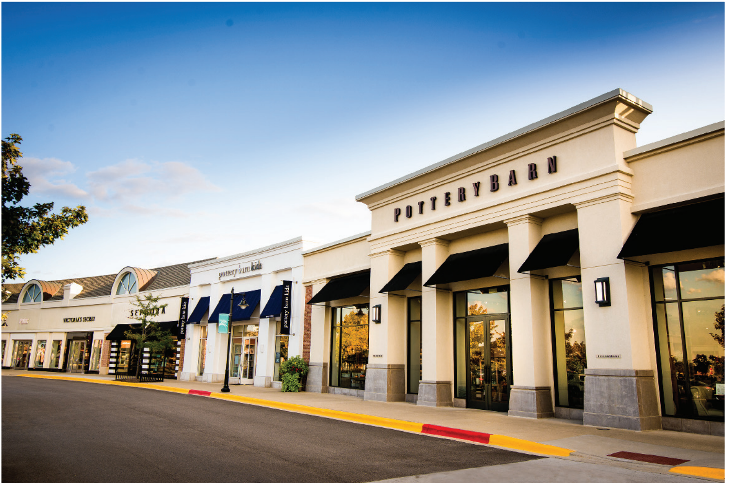
Deer Park Town Center is conveniently located off Lake Cook at Rand Road and Long Grove Road in Deer Park, Illinois, and is the dominant lifestyle center in the Northwest Suburbs of Chicago.