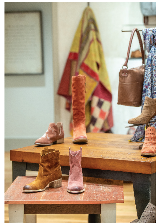
Soft Sharnell Boot (center) with Sundance accessories.