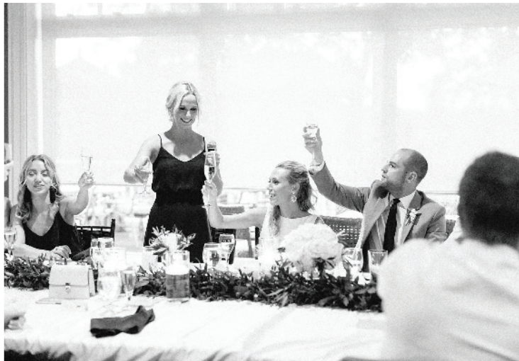
A sentimental toast to the newlyweds.