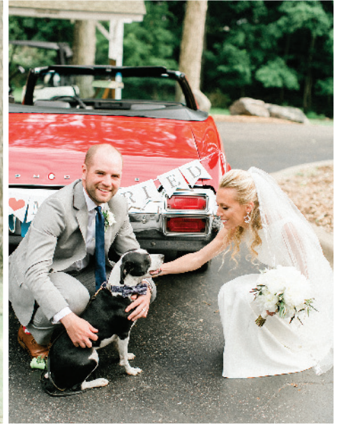
Ned, the couple's rescue dog, was part of their ceremony.