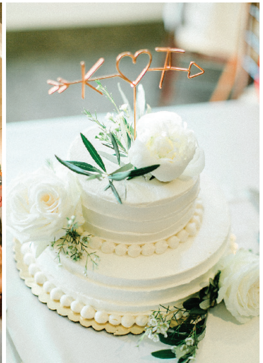
Ambrosia Euro American Patisserie in Barrington designed the wedding cake.