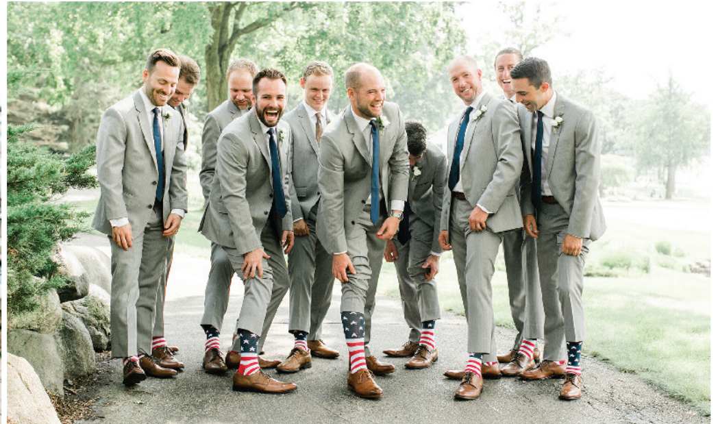
The groomsmen showed their patriotic flare for the couples July 6, 2019 wedding.