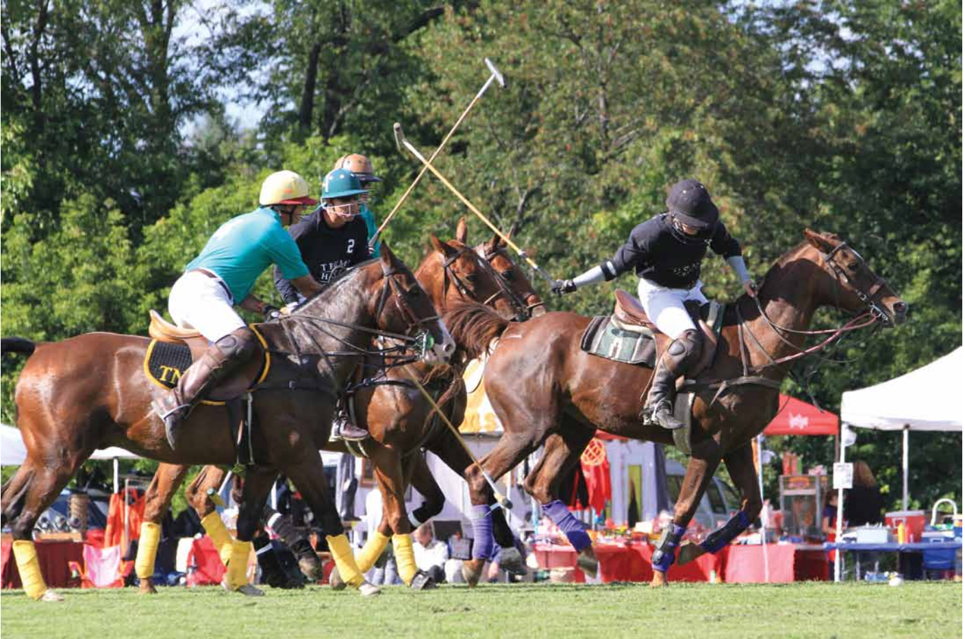
The LeCompte/Kalaway Cup Polo Matches are on September 10.