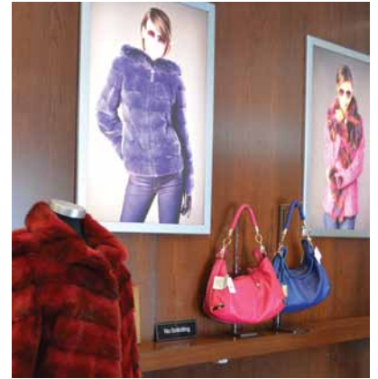
A colorful fur coat and accessories greet visitors to York Furrier in Elmhurst.