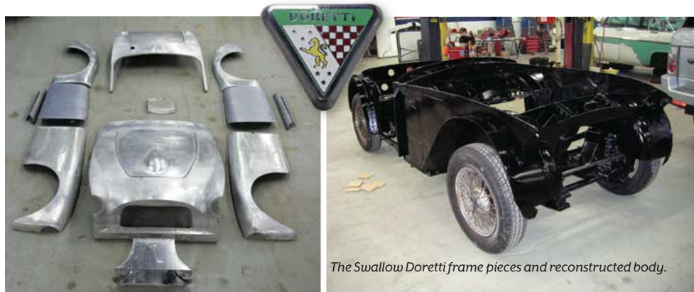
The Swallow Doretti frame pieces and reconstructed body.