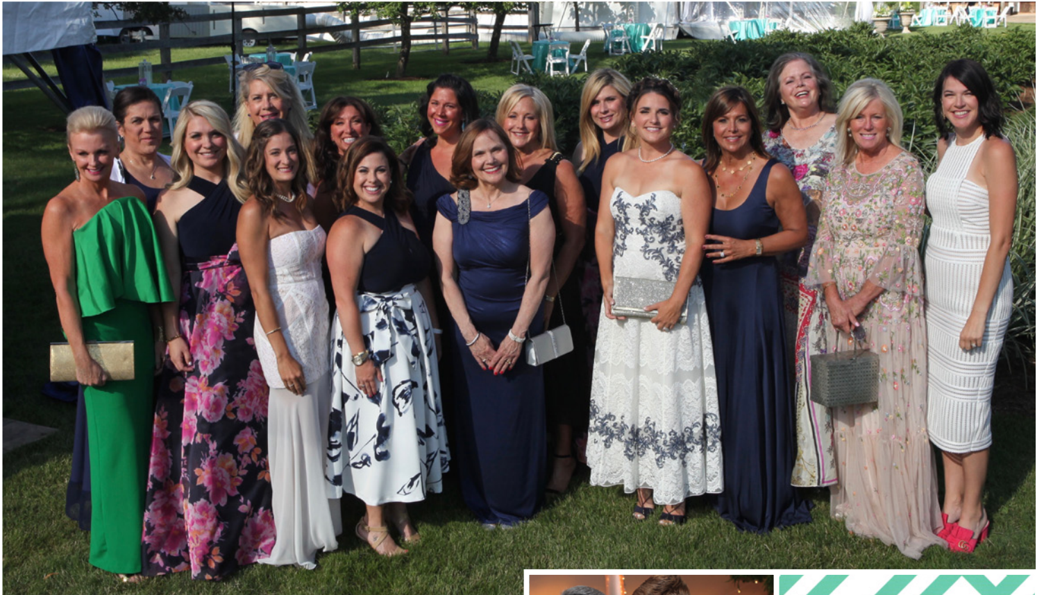
The 2017 JourneyCare Gala Committee.