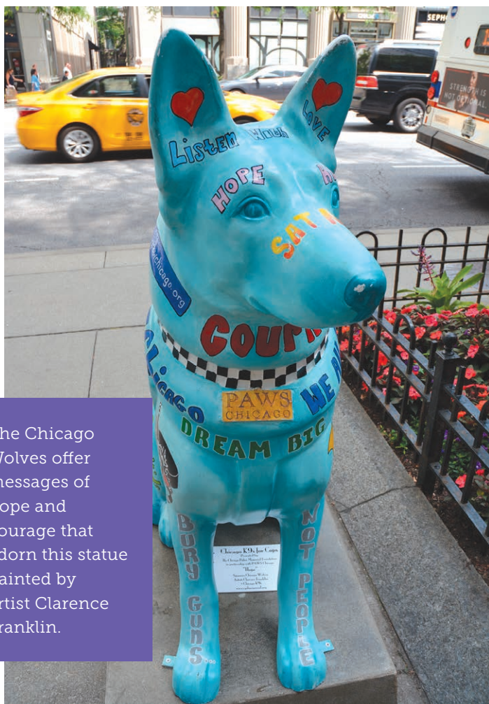
The Chicago Wolves offer messages of hope and courage that adorn this statue painted by artist Clarence Franklin.