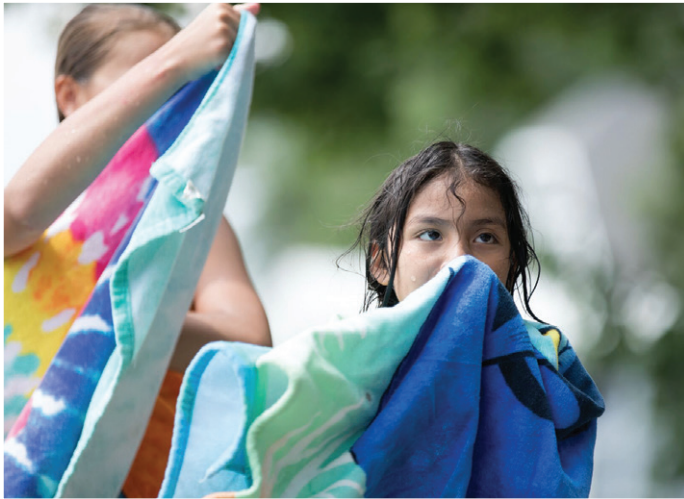
Some of the foster children at this summer's camp.