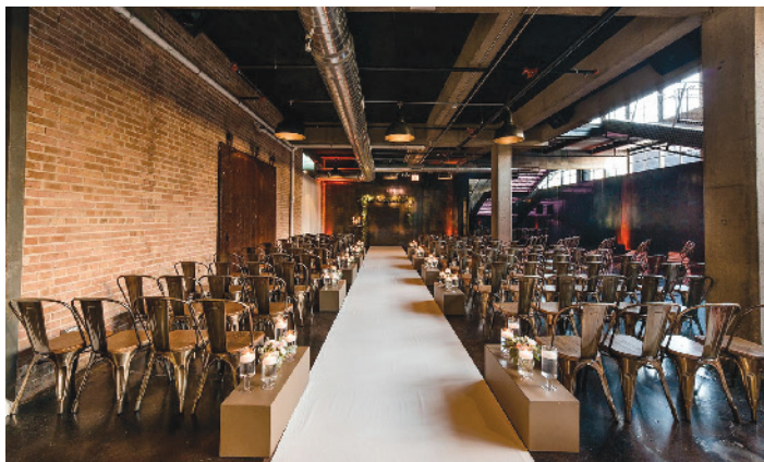
Theater-style seating is arranged for the couple's wedding ceremony.