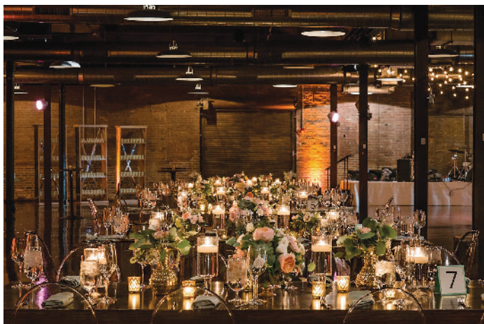
Soft and golden tabletop designs add softness to the warehouse room.

venues to be cost-efficient; but be cautious of additional service charges. Also, consider the many benefits attached to these incidentals. Experienced vendors contracted with warehouses and lofts provide premier products and services, reassuring the bride and groom that their guests will have an enjoyable experience. Staff are polished with the ins and outs of the venue's kitchens, and they are experts with the logistics of the space to handle rental equipment well. Hospitality and smooth space conversion are key components to a seamless and successful affair.