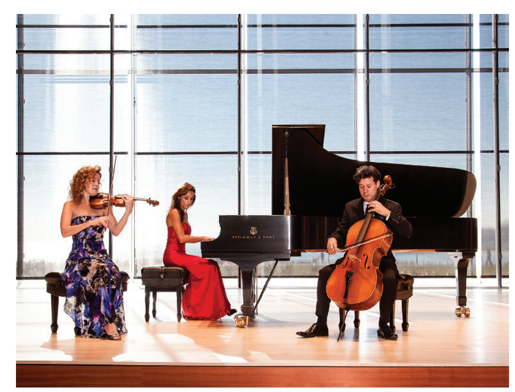
The Lincoln Trio performs on Opening Night, Sept. 14, at Barrington's White House.