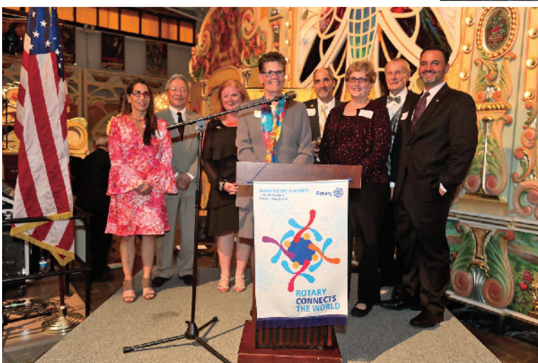
Barrington Breakfast Rotary's Board of Directors.