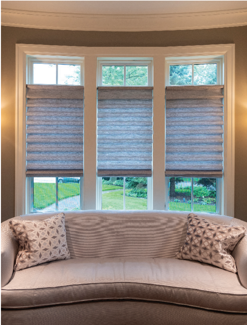
Left page: The elegant media and game room boasts 5.1 surround sound with a custom speaker bar mounted to the television, rear speakers placed in the ceiling, and a subwoofer speaker located in-wall.