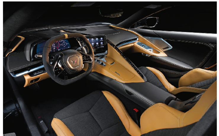
The vehicle's driver-focused, canopy-forward stance draws inspiration from fighter planes and Formula One racecars.

Customers are sure to get just the bespoke 'Vette they want as this new version offers the most personalization options ever found on a Corvette.