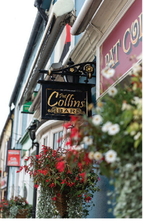
A pub near Adare Manor welcomes guests.