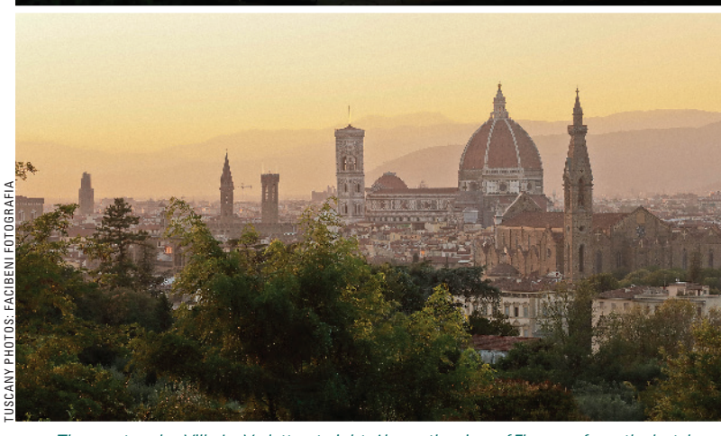
The spectacular \it Villa\,La\,Vedetta\,at\,night.\,Above, the\,view\,of\,Florence\,from\,the\,hotel.