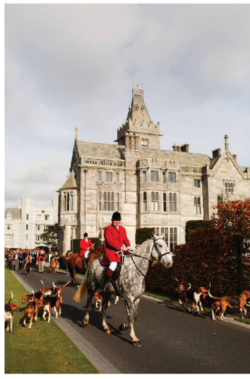
A traditional Master of Fox Hounds leads a procession of guests to lunch.