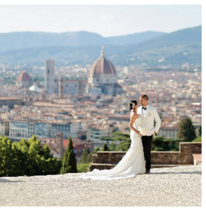
A couple stands on the terrace at Villa La Vedetta in Florence.