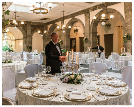
The five-star Grand Hotel Cocumella is the oldest hotel on the Sorrento peninsula. It is a modern Italian venue located on the Amalfi Coast, and is recommended by Christina Currie Events for its centralized location.