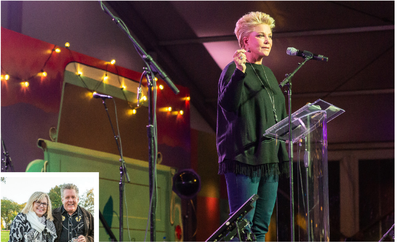
Joan Lunden is an American journalist, author, and television host. Lunden was the co-host of ABC's Good Morning America from 1980 to 1997. Her personal health care journey, which she shared, was informative, relevant, and moving.