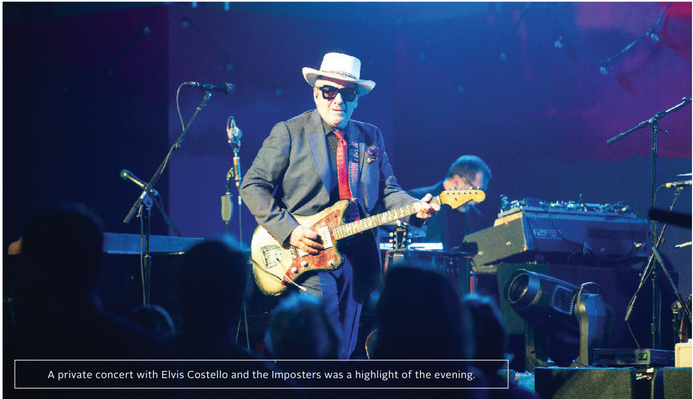
A private concert with Elvis Costello and the Imposters was a highlight of the evening.