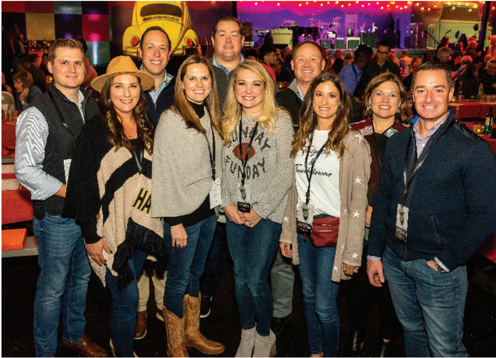
The Shepherd's Circle is a group of young families who support Good Shepherd.