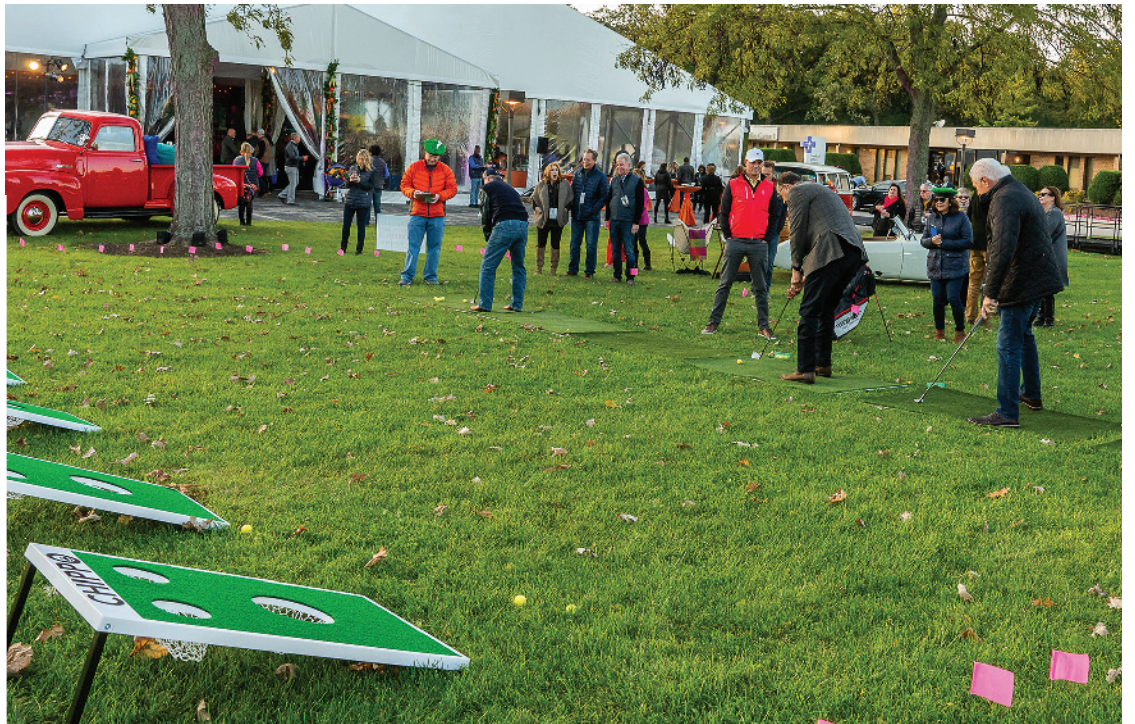
Guests competed in the Chippo golf game.