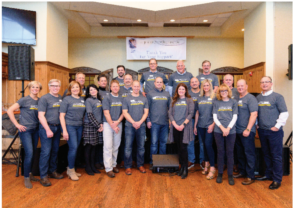
JPF Board and Auxiliary Board at the 2019 JPW Brew Revue.