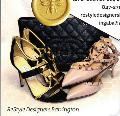
ReStyle Designers Barrington