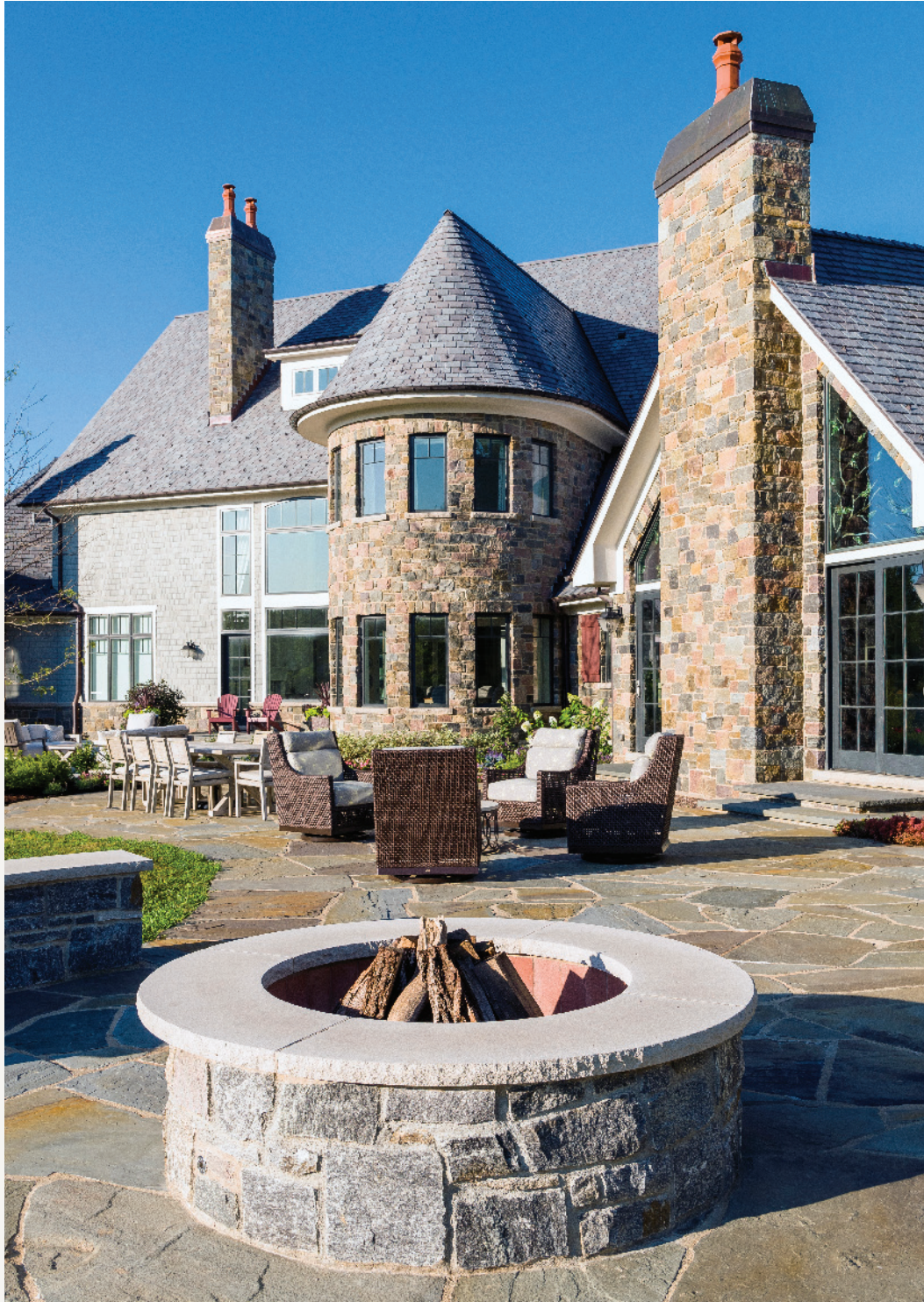
An outdoor fireplace is a focal point on the grade level that sits several feet above the pool area. Flowers and herbs are planted closer to the home.