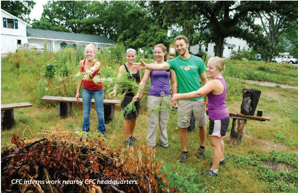
CFC interns work nearby CFC headquarters.