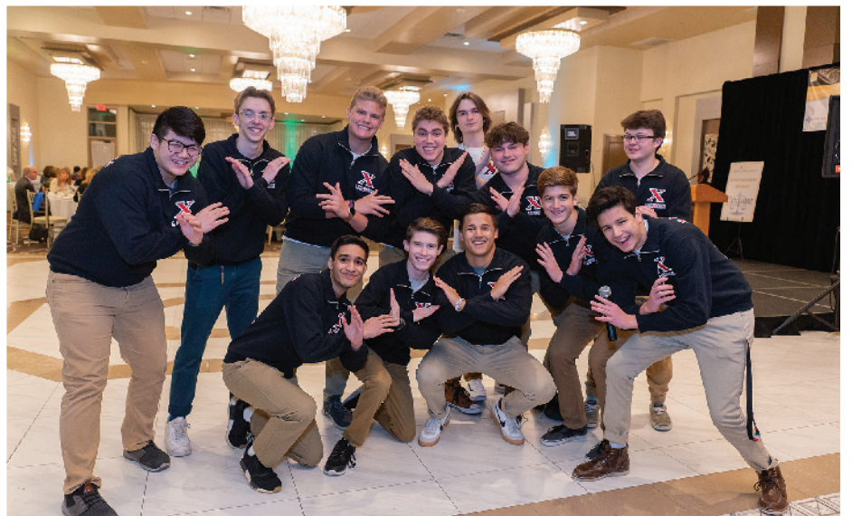
Barrington High School Men's acapella group "X" performed.