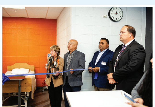
Getting ready for the ribbon cutting in the new BHS Health Sciences Lab at the recent Alumni Legends: Prescription for Success.