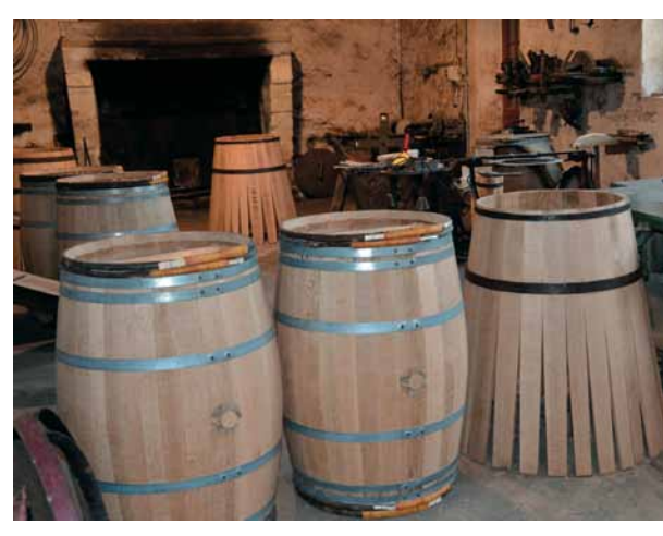
The wine barrel making operation at Chateau Margaux in Medoc, France.

first-hand just how different types of oak can influence a single wine differently. At the Del Dotto winery, the proprietor, David Del Dotto, led two of my friends and me on a tasting of one of their premium Cabernet Sauvignon wines where the only difference was the type of oak. The grapes were all harvested from one small vineyard, vinified the same, and then placed in 13 different types of oak - several from different forests in France, one from Slovenia, and a half dozen or so from different U.S. states. In addition, each type of wood varied by receiving a light, medium, or heavy toast. Although we spit much of the wine, none of us could believe how different all the wines were based on toast levels and forests of origin. Given this experience, it helped me understand how large an impact oak can have on different grapes, most of which are lighter in flavor than Cabernet Sauvignon.