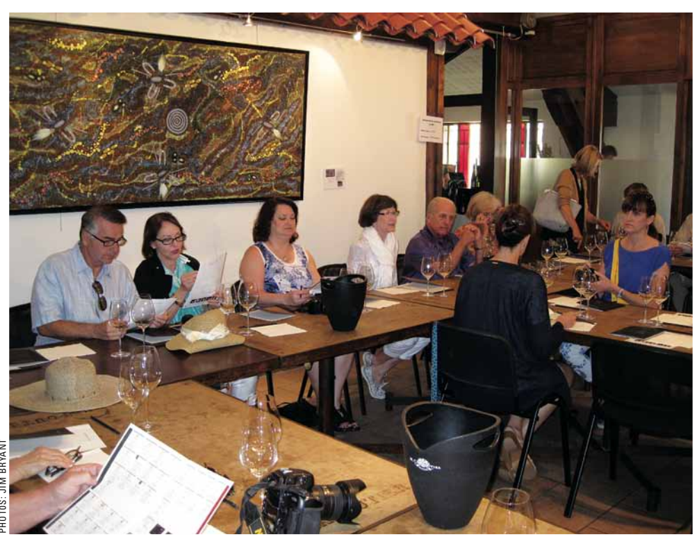
The Chapoutier tasting room.