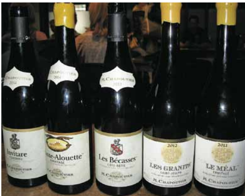
The wines enjoyed at Chapoutier.

The first red wine tasted was the 2013 Les Bécasses from the Côte-Rôtie appellation made 100 percent from Syrah grapes. Dark red in color, it had a nose of exotic spices, violets, rosemary, and black olives and raspberry. The mouth feel was rich and spicy with minimal levels of vanilla from oak aging. This wine would pair well with wild