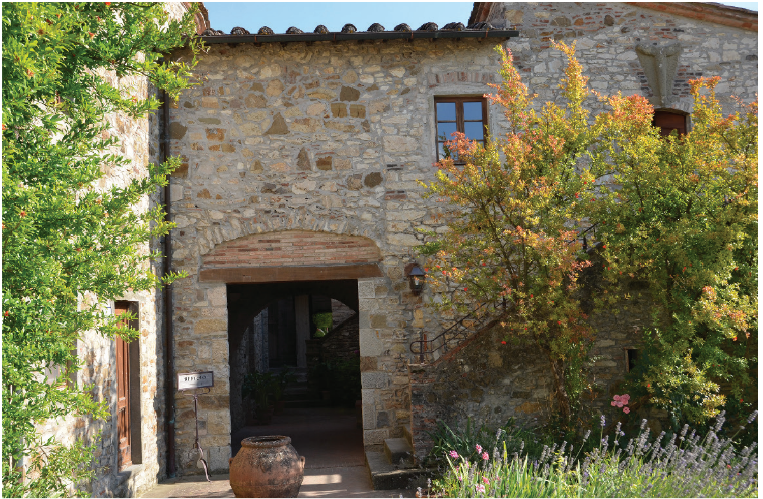
The rustic entry to Fondoti Winery, which is located in the Chianti region of central Tuscany, Italy.