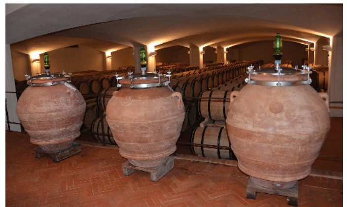
Amphorae age fine wines at Fontodi Winery.

All the wines were wonderful beginning with the Merino Sauvignon Blanc 2017, the Chianti Classico 2015, and Vigna dell Sorbo 2014. We finished with two sterling examples of Flaccianello, the 2009 and 2015. Both were of the highest order—almost an ethereal experience. I encourage you to buy Flaccianello whenever you have the chance. A Votre Santé! 🍷