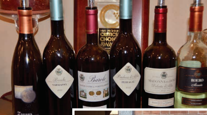
On left: Baroli tasted at Paolo Scavino winery. Right: Dinner wines served at Marchesi di Barolo.