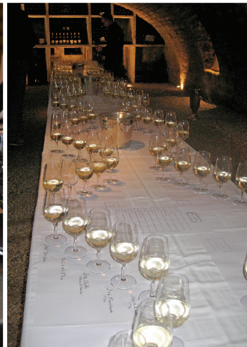
A morning's work tasting 10 fantastic wines.