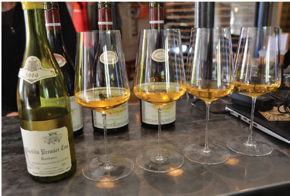
Chablis Premier Cru Butteaux